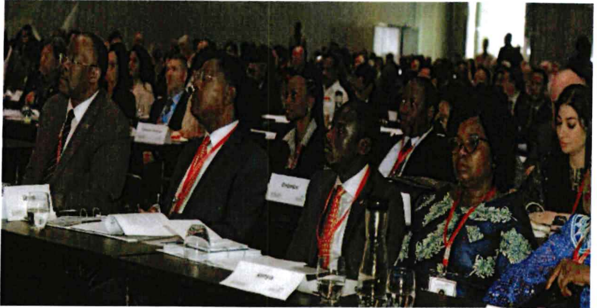
The Rt. Hon. Speaker of the National Assembly with Members of CPA Kenya Branch Delegation during the General Assembly

Parliament in strengthening democratic resilience in the era of fake news and synthetic media.