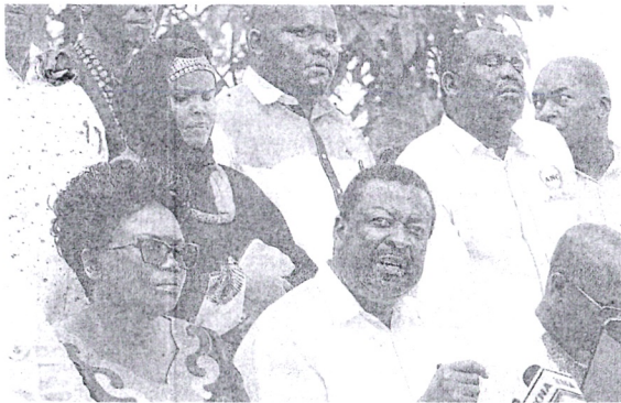
ONDARI OGEGA | NATION

Amani National Congress (ANC) party leader Musalia Mudavadi addresses a press conference in Kisumu yesterday.