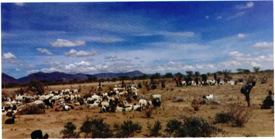
2,600 goats recovered during “Operation Maliza Uhalifu in North Rift” in Turkana East Sub-County on 6th April, 2023