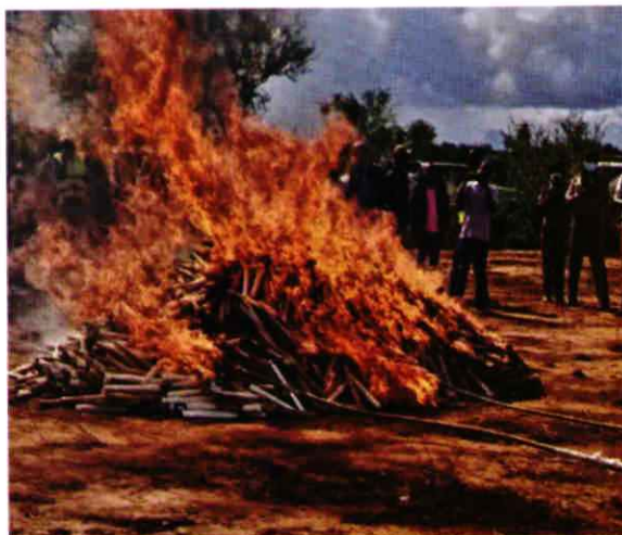
477 Kilograms of Bhang intercepted in Kilifi South, 560kgs Cannabis Sativa set ablaze in Makindu, Makueni County