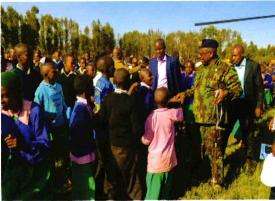
VULNERABILITY: School children interacting with the Inspector General of Police during his operational tour in Meru on 19 th June, 2023