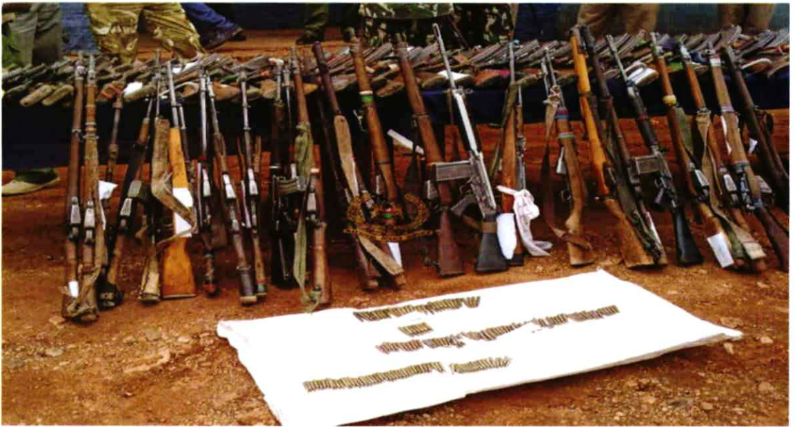
Illegal firearms recovered during Operation Maliza Uhalifu in North Rift