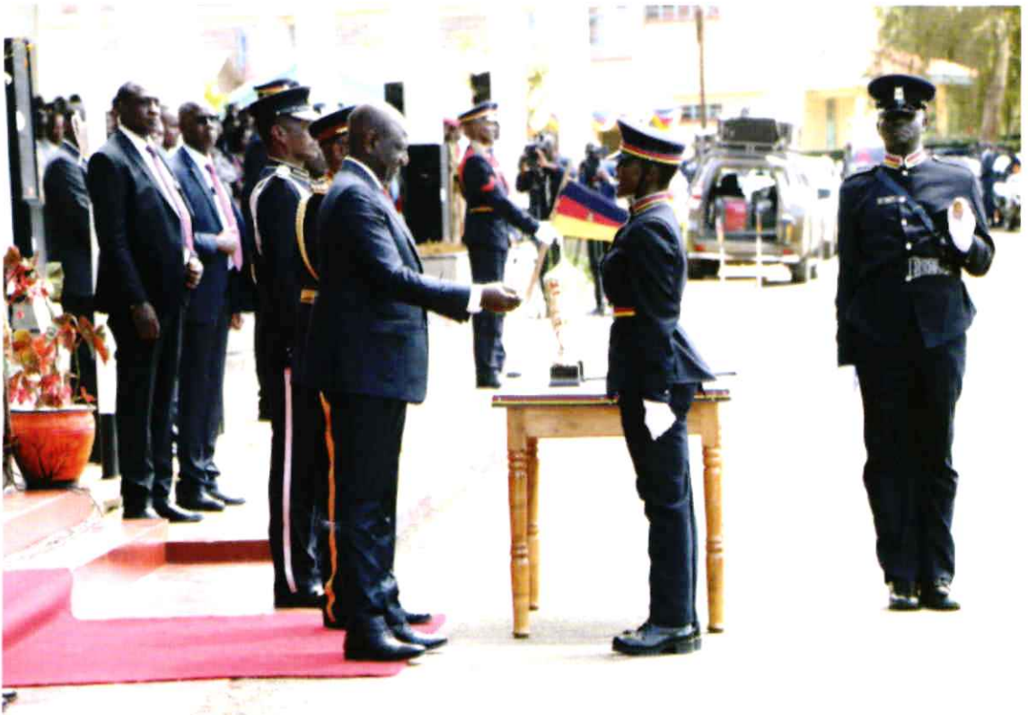
HONOR: H.E. President Dr. William Ruto presents a Cane of Honor to the Best Female Recruit during Pass Out Parade at the National Police College Kiganjo Main Campus in January 2023, marking the President's inaugural Pass Out Parade for NPS.

Towards realisation of the vision of an efficient, professional and responsive police service and ensuring that the Service earns the confidence, respect and trust of the public, NPS has been conducting recruitment drives targeting various cadres of Police experts and talents. In 2023, H.E., Hon. William Ruto, PhD., CGH, President of the Republic of Kenya and Commander-in-Chief of the Defence Forces presided over Pass Out Parades at Kiganjo as well as Embakasi A and B Campus where a total 5,867 recruits joined the Service. Last year, no recruitment was conducted.