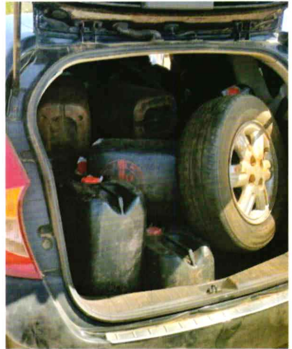
575 litres of Ethanol alcohol impounded at Elementaita Police Station in Nakuru County on 27th December, 2023