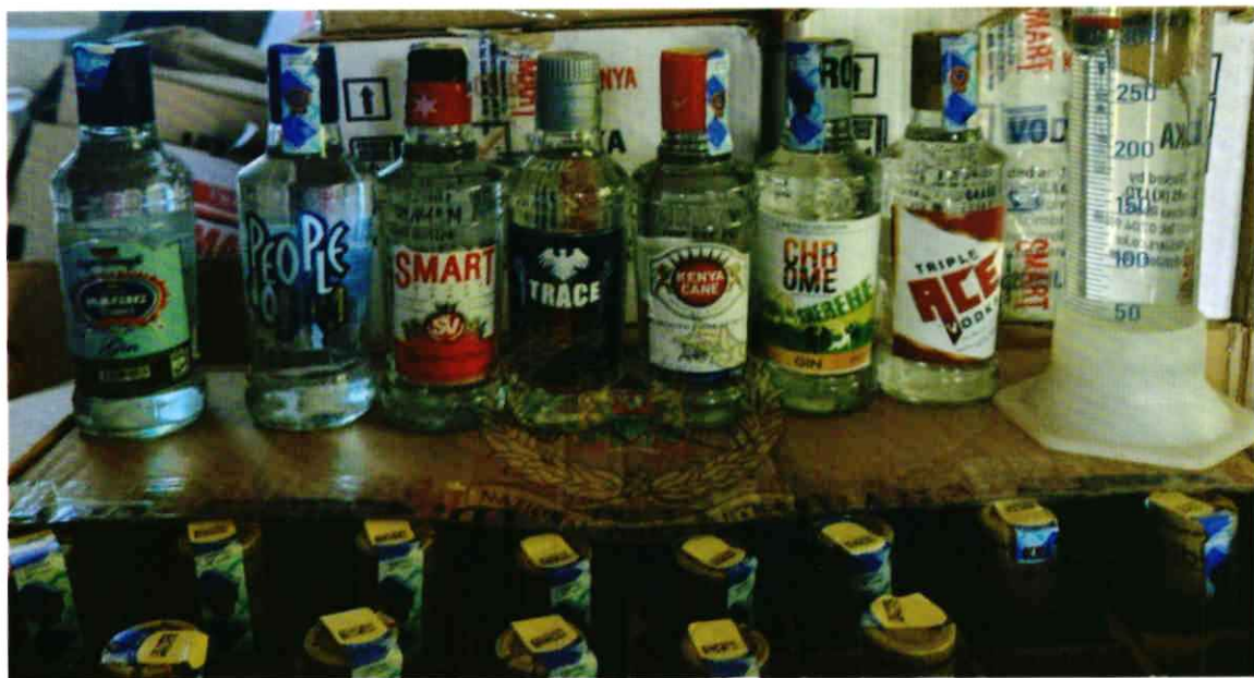
Counterfeit alcoholic drinks seized during a multi-agency operation carried out in Murang'a County on 22 nd September, 2023

Counterfeit and contraband goods deny consumers the opportunity to enjoy benefits that come with genuine products. They encourage unfair business competition, deny government revenues in unpaid taxes, and expose consumers to risks, which sometimes lead to fatalities. In the long run, counterfeits undermine intellectual property rights, and hurt innovations. Further, proceeds from Counterfeit and Contraband goods may end up furthering organized criminal activities such as terrorism and money laundering, which compromises national security.