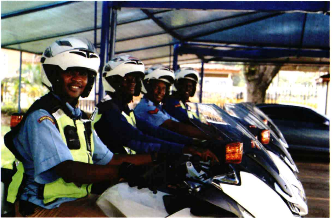
ESCORT: Police Riders from the Presidential Escort Unit, one of the specialized NPS Formations/Units under the Kenya Police Service at NPS HQS