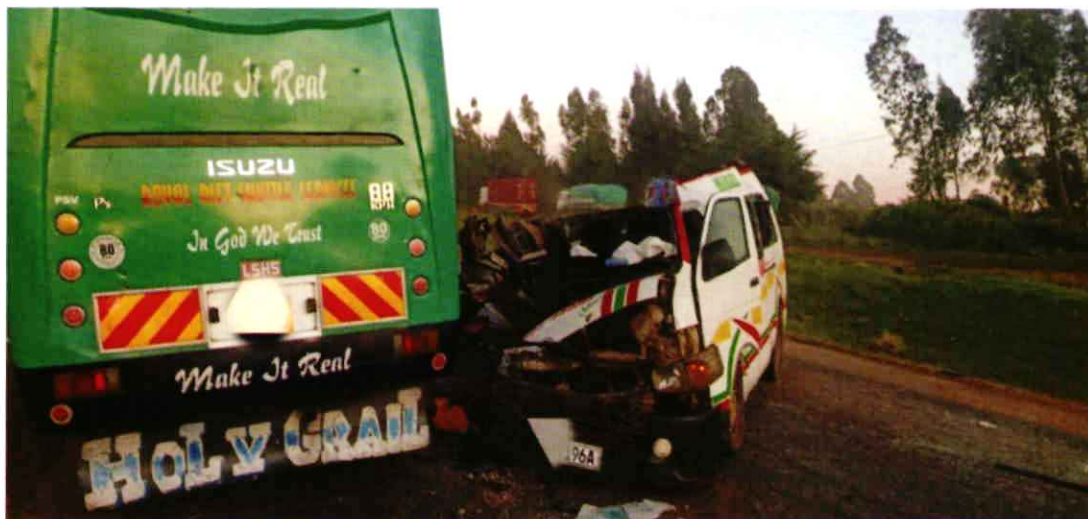
Fatal road accident at Hill Tea Area along Eldoret - Nakuru Road on 18th December, 2023