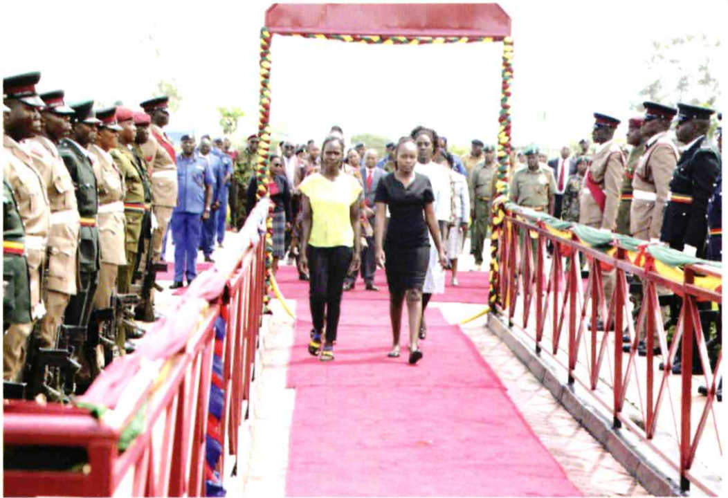
HEROS: Widows of Fallen Heroes going to lay a wreath during the 5th Commemoration of 37 NPS and Kenya Prisons Service Officers killed in the brave execution of their duties on December 14, 2023.