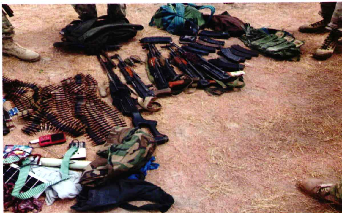
Warfare equipment recovered by Police on patrol from Al-Shabaab militants in Garissa County in May 2023