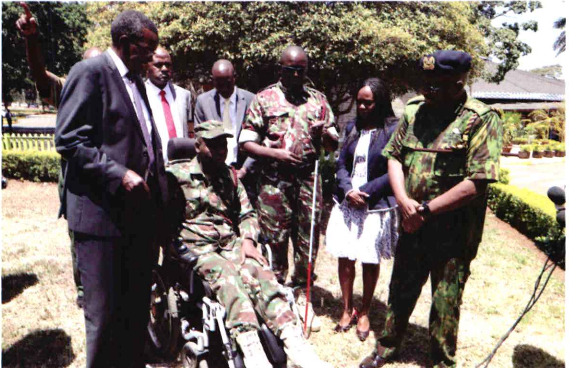
TASKFORCE: CJ Emeritus David Maraga (left) and IG Japhet Koome interact with NPS Officers injured in line of duty during the NPS proposal submission to the Maraga-led Police Taskforce meeting at Bomas of Kenya on January 30, 2023