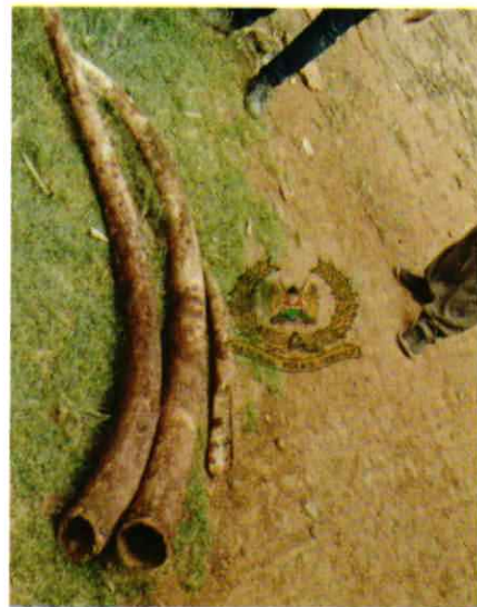
Elephant tusks recovered in Embu County on 23rd September, 2023