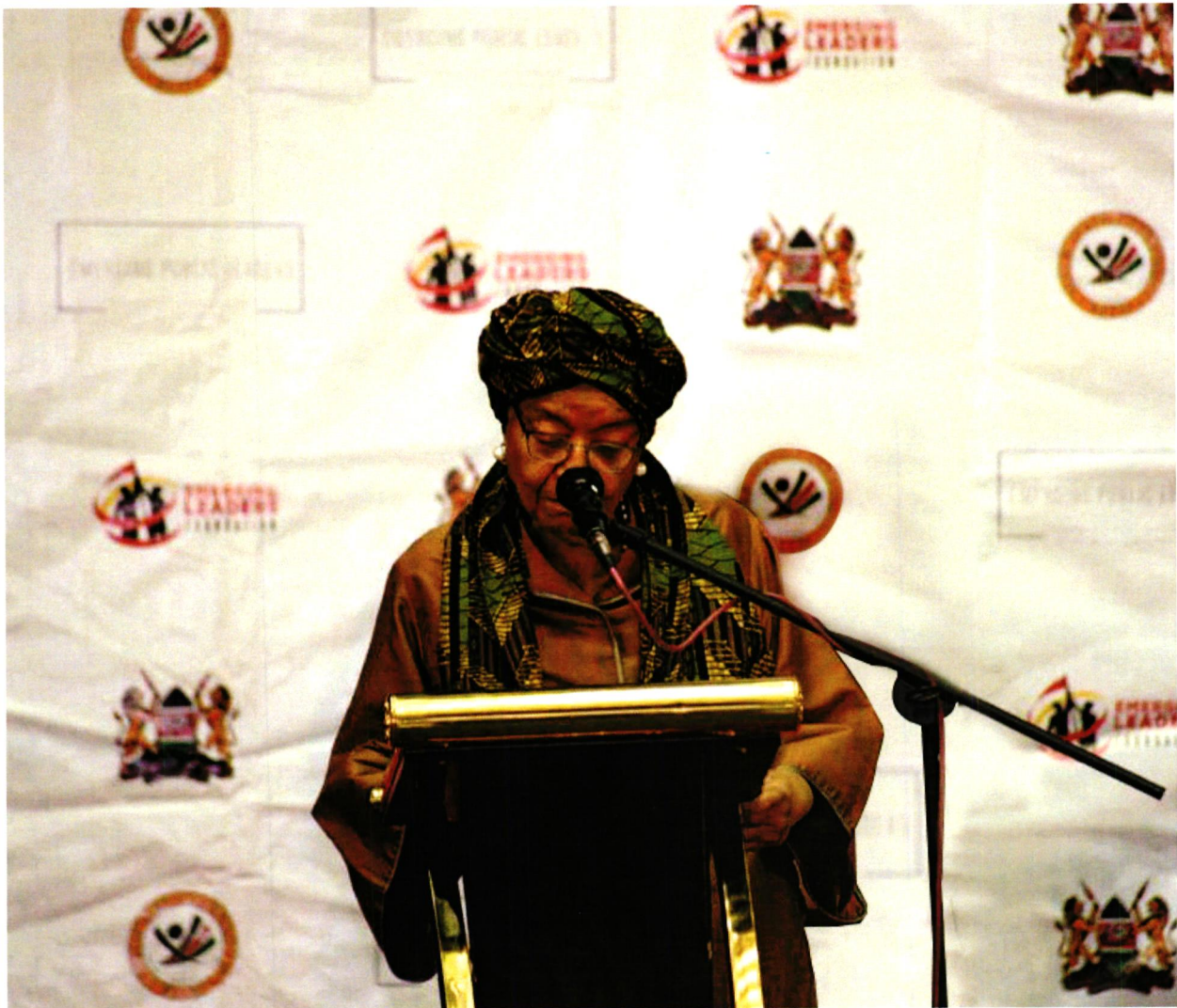
Former Liberian President Ellen Sirleaf Johnson addressing the first cohort of Fellows under PSELF programme at the KICC Tsavo Ballroom during the inauguration ceremony on 15th March 2022.