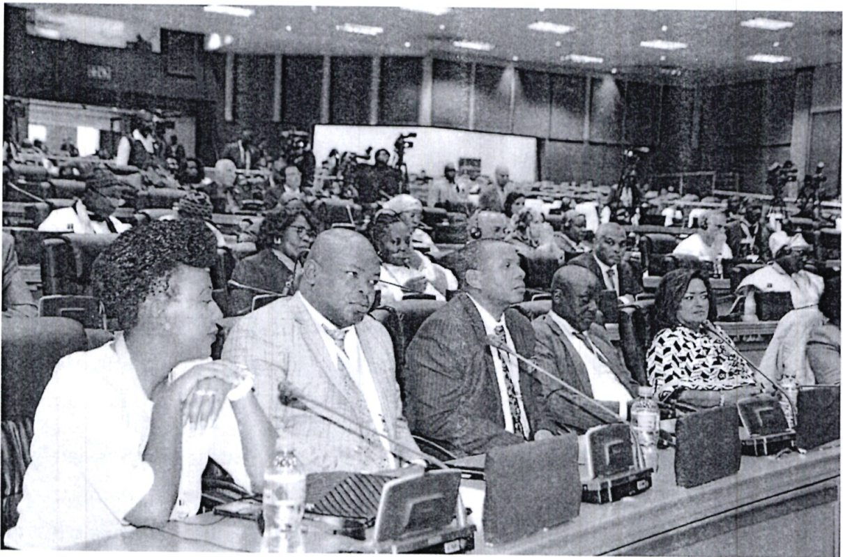
Members of the Delegation keenly follow proceedings during the Climate Change Summit (held on 16 th & 17 th May, 2023) where H.E. President (Dr.) William Ruto, CGH, Commander-in-Chief of Kenya Defense Forces, was the Chief Guest