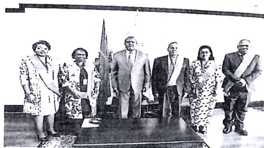
Courtesy call on the PAP President