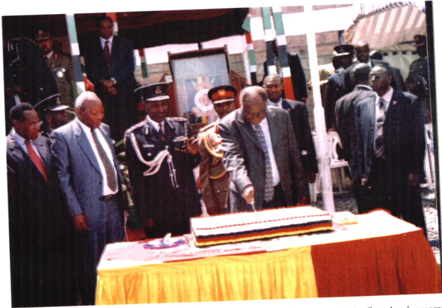
His Excellency, Hon. Mwai Kibaki cuts a cake during the celebrations to mark the first Anniversary of Community policing initiative at Ongata Rongai Police station.