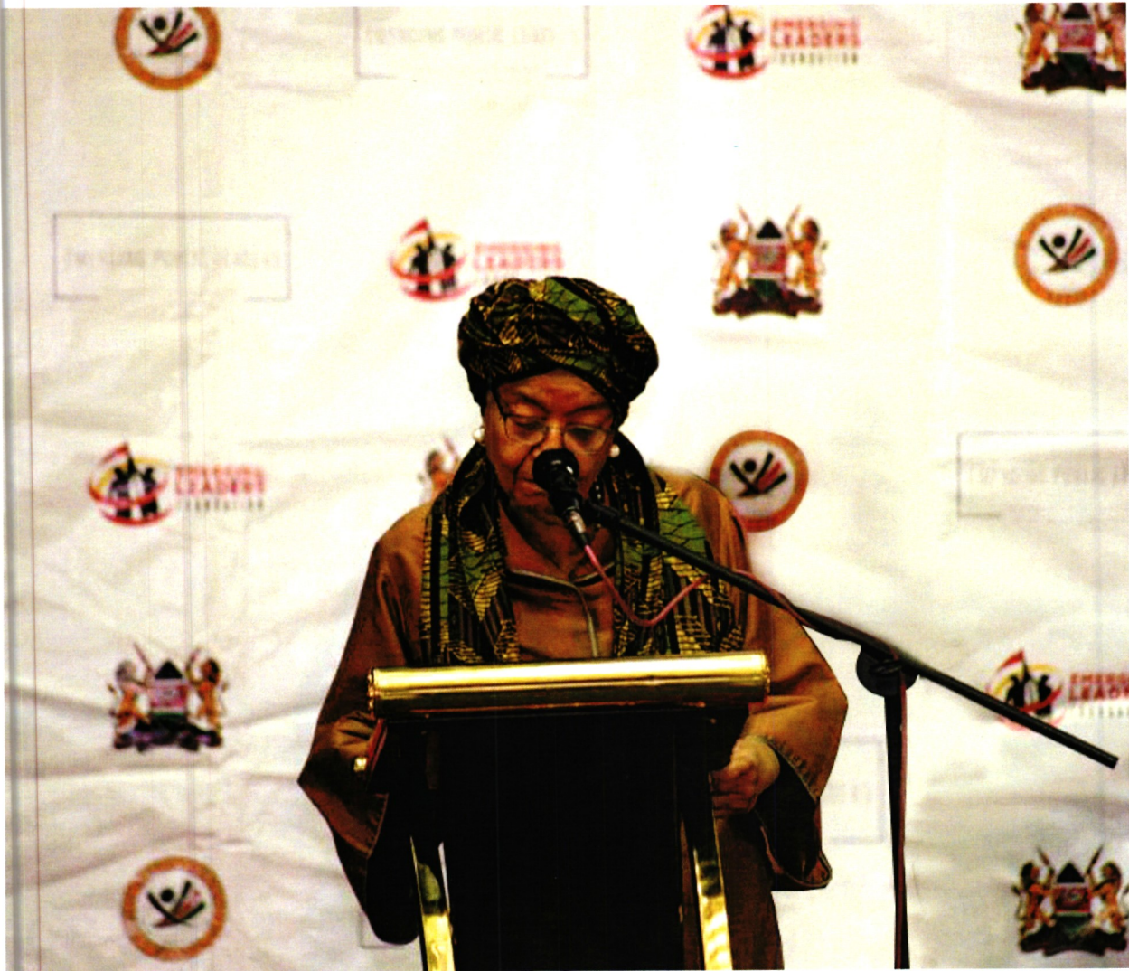
Former Liberian President Ellen Sirleaf Johnson addressing the first cohort of Fellows under PSELF programme at the KICC Tsavo Ballroom during the inauguration ceremony on 15th March 2022.