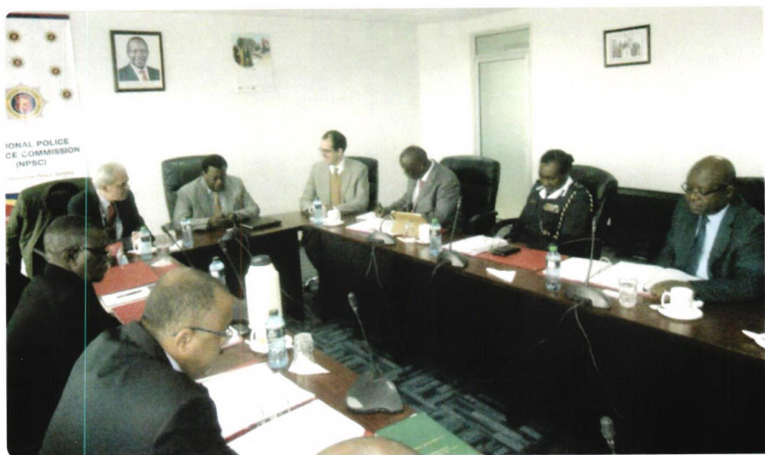
The Chairman and NPSC Commissioners host UNODC Officials at the NPSC Boardroom