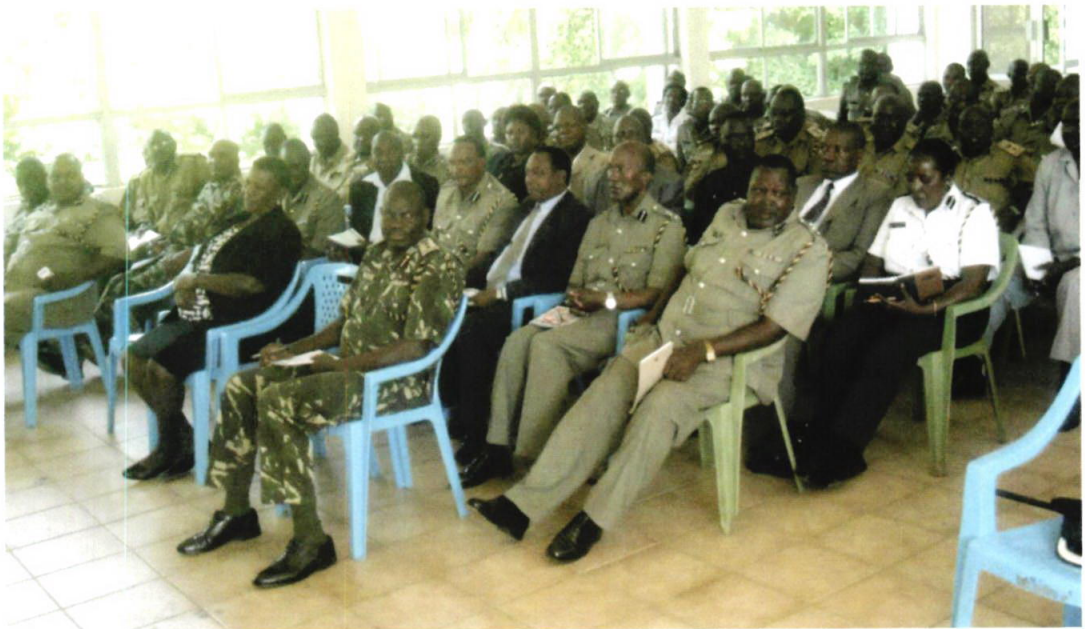
A section of Senior Police Officers during Sensitization on Vetting in Kakamega County