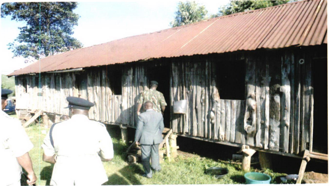
Police houses in Kiirua, Meru County, which are set for rehabilitation under the police reforms.