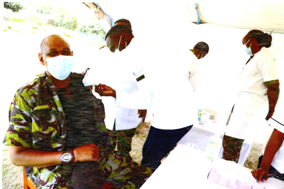
KDF service personnel receiving Covid-19 jab at the Defence Memorial Hospital