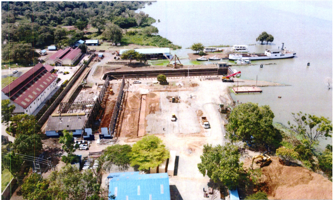
Finishing works of the Kisumu based Kenya Shipyards as at 04 March 2021

3.13 Shipyards Construction. The completion of the shipyard will strengthen the ship construction and repair capability of the Kenya Navy. This shipyard is set as a national strategic capability with the clientele from other Ministries, Departments and Agencies (MDAs). This facility will create employment, generate revenue, reduce overseas repair costs and spur national and regional technology transfer.