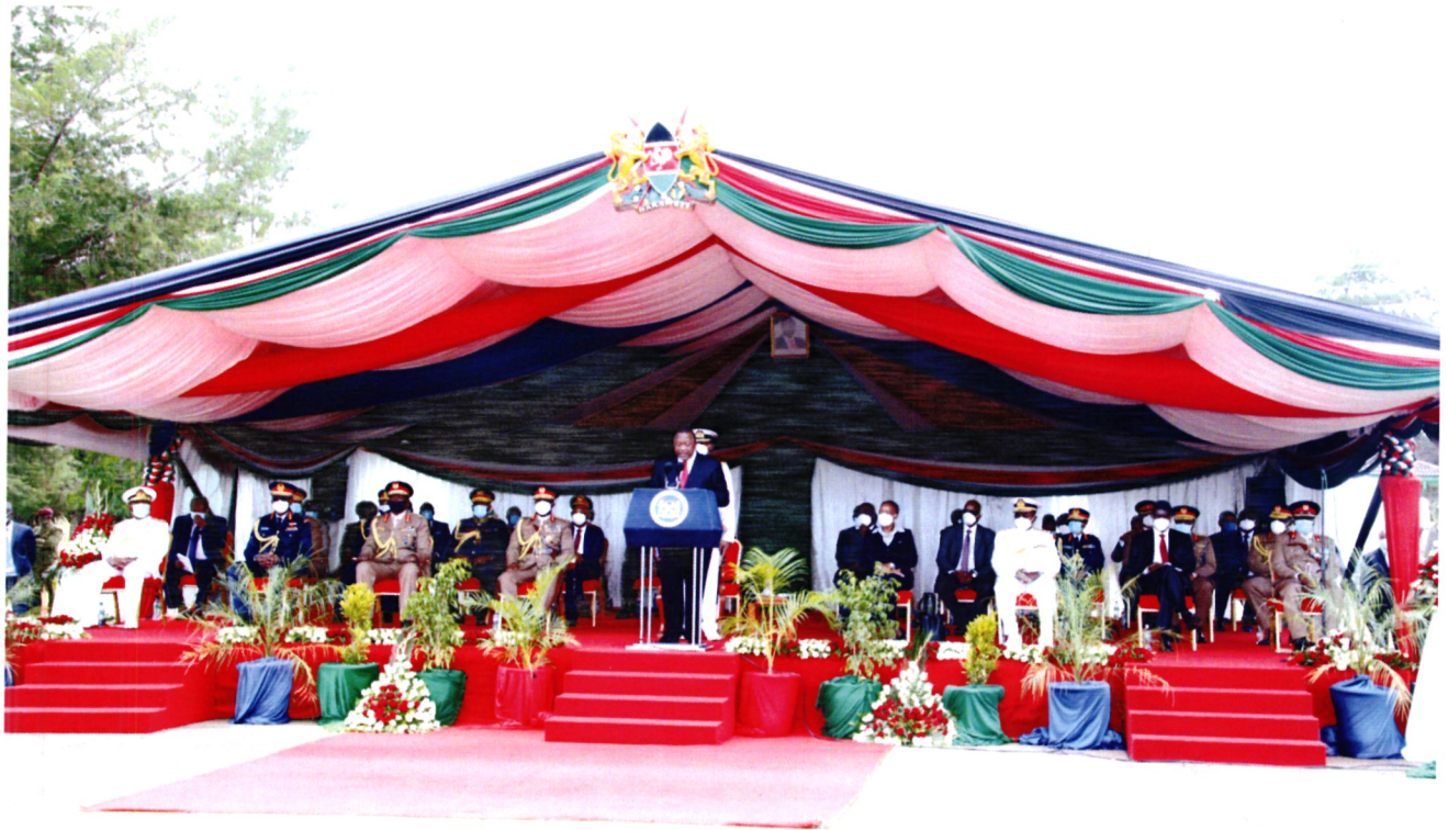
H.E. Hon Uhuru Kenyatta, CGH - President of the Republic of Kenya and Commander-in-Chief of the Kenya Defence Forces, giving his address during a recruits' pass-out parade at the Recruits Training School in Eldoret on 24 September 2020