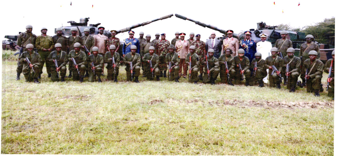
A visit by the Chief of the Defence Forces Gen Robert K Kibochi to 81 Tk Bn on 24 July 2020