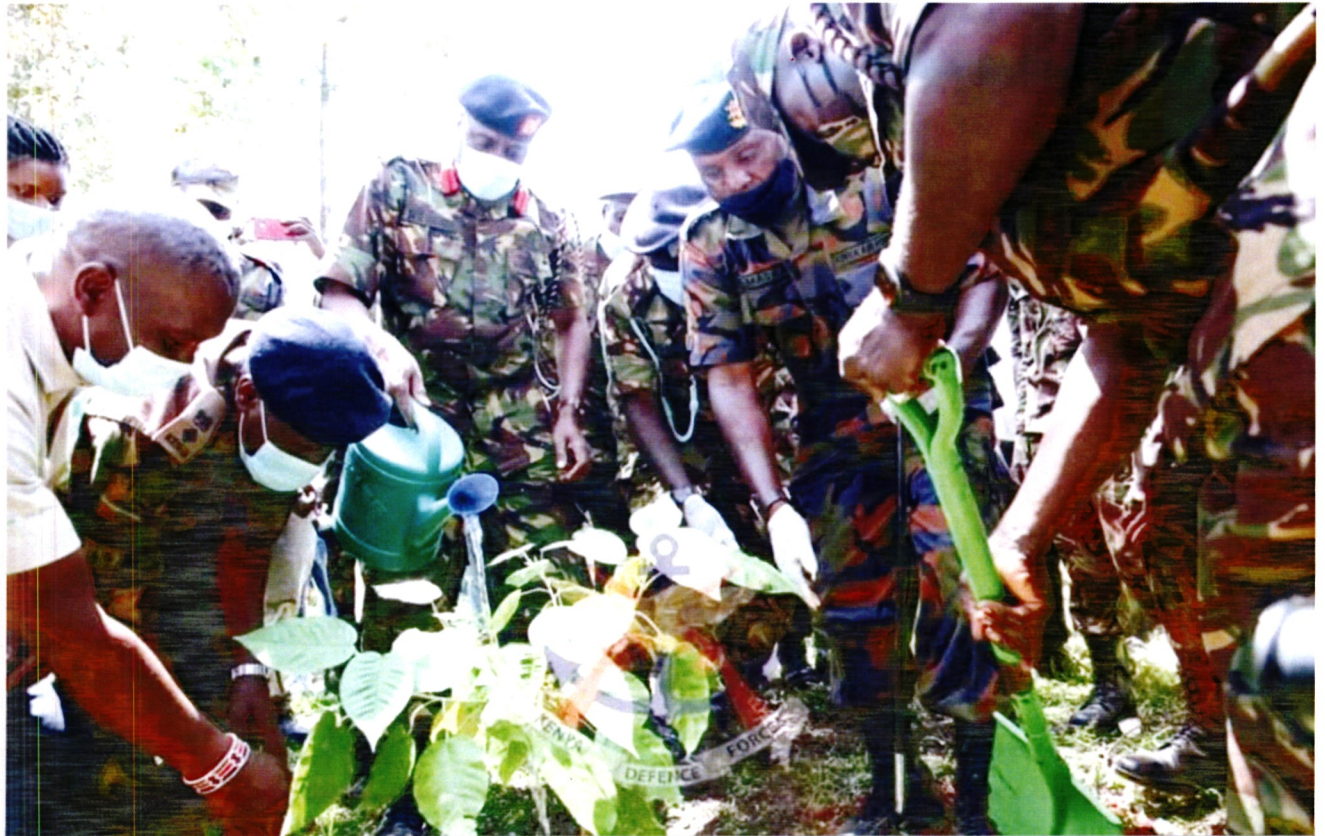
KDF Officers from the International Peace Support Training Centre (IPSTC) planting trees on 17 Nov 2020.

3.18 The Ministry implemented the Government Policy on National Cohesion and National Values as provided for in Article 10 of the Kenya Constitution 2010 by performing exemplarily in the National Cohesion and Values criterion in the year under review.