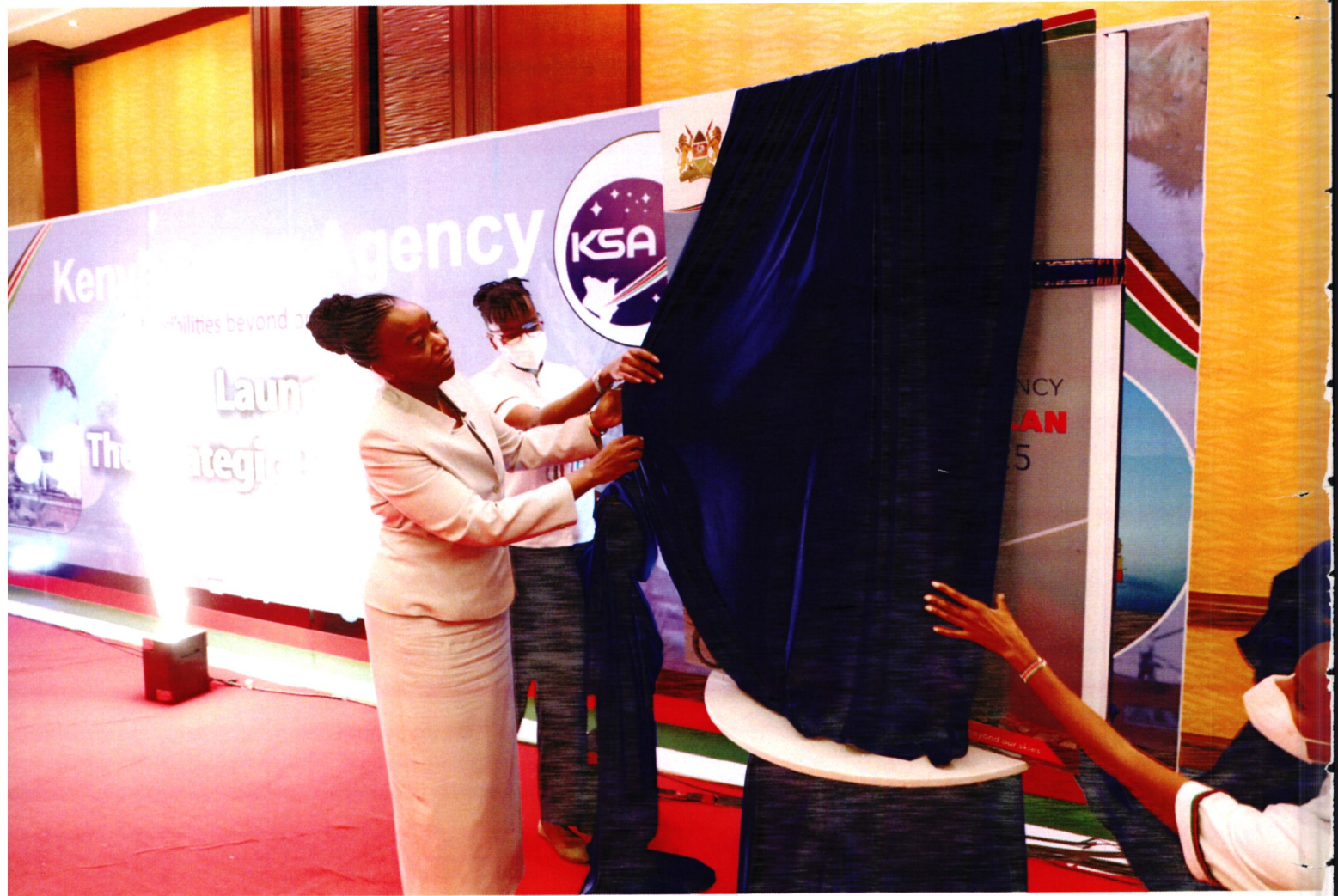
CS Defence Amb (Dr.) Monica K Juma, (Oxon). CBS during the launch of the Kenya Space Agency (KSA) Strategic Plan 2020 - 2025 on 21 October 2020 at the Serena Hotel, Nairobi.