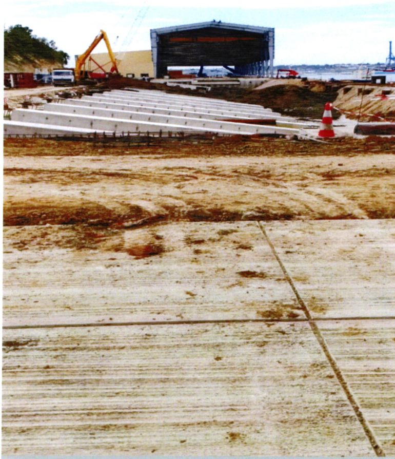
4000-ton slipway under construction at Mtongwe as at 01 October 2020

3.20.1 The design and construction of the 4000-ton slipway at Mtongwe is meant to enable Kenya perform mid-life fitting and manufacture of own ships and also extend to the neighbours and the world for commercial gains. The project is on schedule as planned and 90% completed as at the end of the period under review. Commissioning of the project is earmarked for end of 2021.