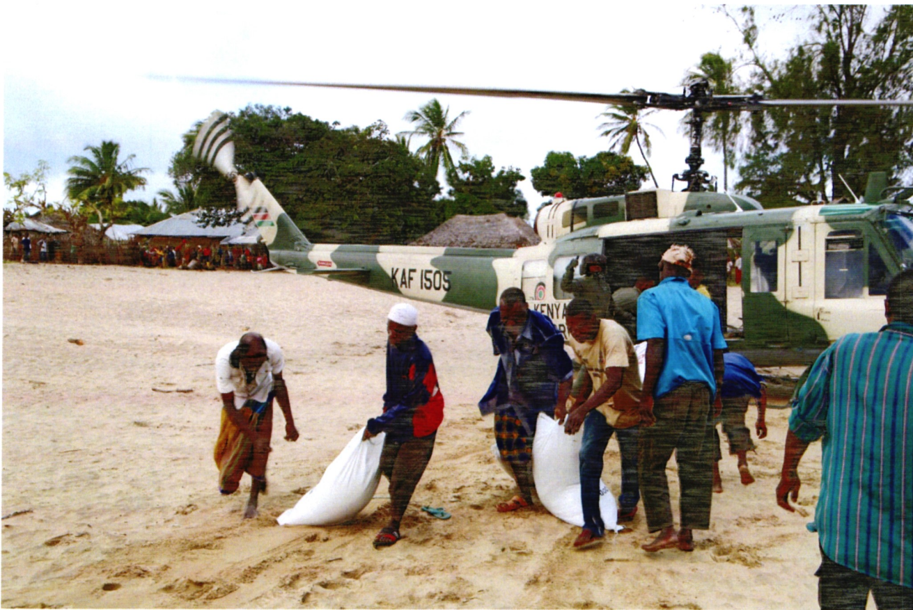
Distribution of food by use of KAF helicopter at Ozi-Kipini, Tana River County, on 22 June 2021

11.3 Distribution of Relief Food: Kenya Defence Forces (KDF) troops and the Multi-Agency team operating in Lamu County airlifted relief food from Minjila to Ozi-Kipini within the Boni enclave. The delivery was part of enhanced efforts by security agencies operating in the area, aimed at cushioning residents from the impact of severe floods.