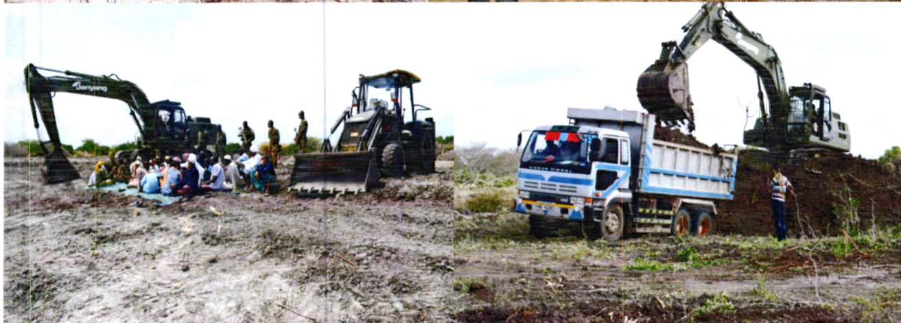
The Ministry assisting local community in Sandaro Sangailu in the construction of an open-air water pan (Silanga)