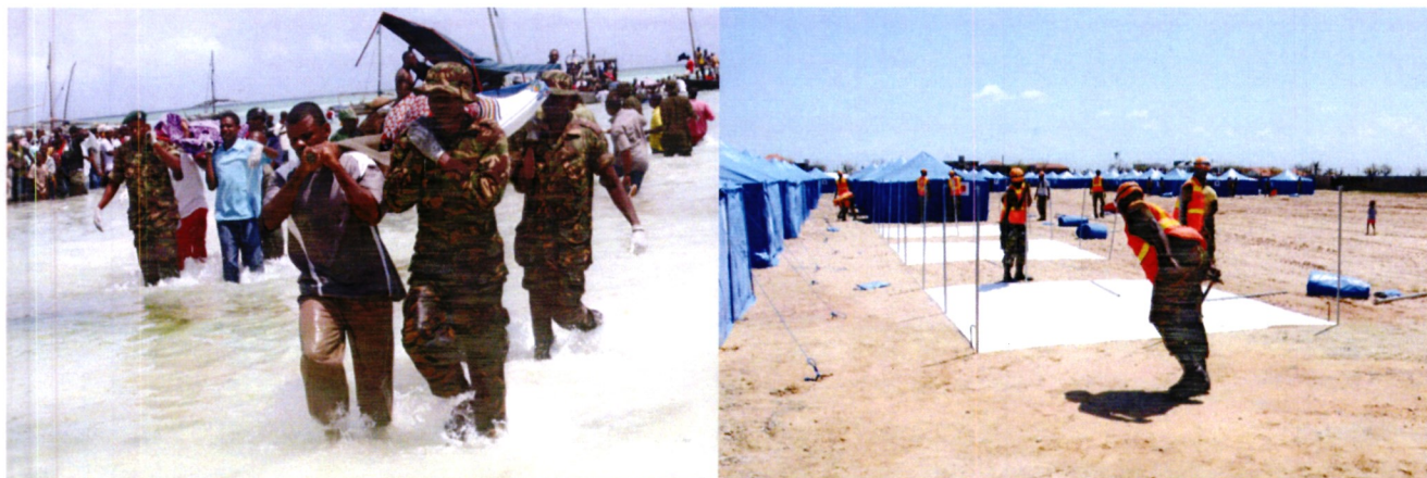
KDF in rescue operation and helping pitching tents in Mozambique on 21 Oct 2020

3.11.4 Humanitarian Relief Operation in Mozambique: On 14 October 2020, KDF conducted humanitarian relief operation in Mozambique - after suffering cyclone effects - by delivering food consignment and medical supplies to the affected.