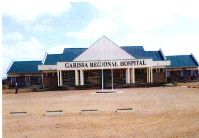
The ongoing construction of the Garissa Regional Hospital at Modika Barracks as at 02 Oct 2021