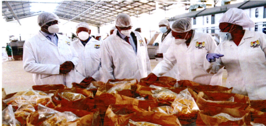
CS for Defence Amb. Monica K Juma being shown finished products during her visit to the KDF Food Processing Factory (KDF-FPF), Gilgil, on 14 August 2020

This is a Ministry of Defence Vision 2030 flagship project and also supports three pillars in the Big 4 Agenda on Manufacturing (Food Processing), Universal Health Coverage, and Food Security and Nutrition.