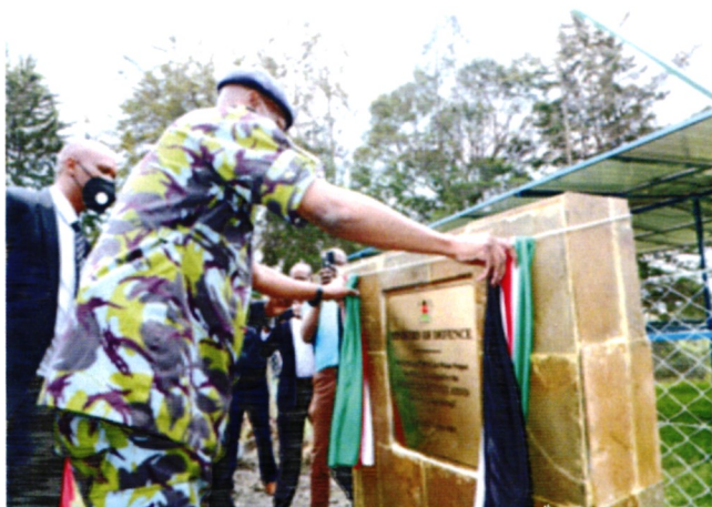
Brig D N N Kamuri , Chief of Infrs commissioning Kiambaga Health Care Water Project on 25 Aug 2020

3.11.1 Provision of water: The Ministry sank community boreholes and assisted locals to harvest rain water through construction of water pans, dams, shallow wells and underground water collection tanks. These projects have benefitted the locals by supplying clean potable water for human & livestock needs and for small-scale farming. The water projects in dry areas, especially the north-eastern parts, reduced movements in search of water for livestock.