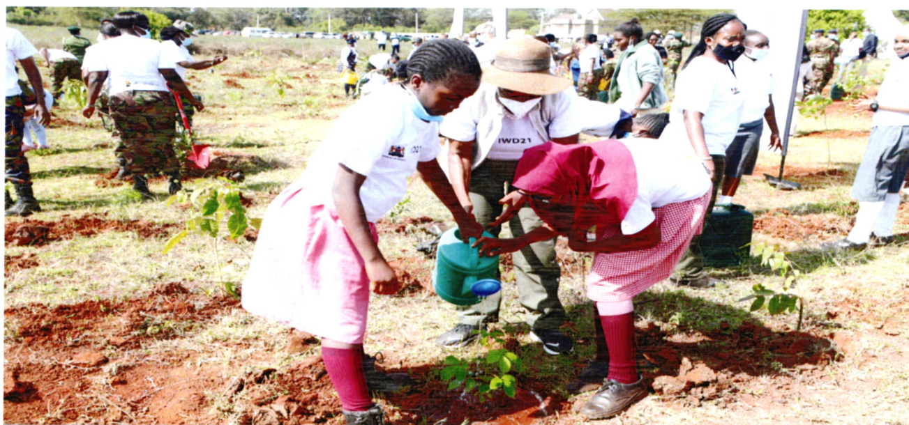
CS Defence, Amb. Dr. Monica Juma and other KDF personnel planting trees with school pupils at Kibiku Forest on 06 March 2021.

3.17 Environmental Security: In support of the Government effort on environmental sustainability in line with SDGs and Kenya's Vision 2030, MoD has actively participated in environmental conservation efforts through planting of trees in designated areas within the Kenya forests. The Ministry - through the Environmental Soldier Programme (ESP) - planted a total of 1,388,629 seedlings in cantonments and wetlands and adopted forests allocated by the Ministry of Environment and Forestry. This was achieved by working in partnership with other supporting agencies and organizations.