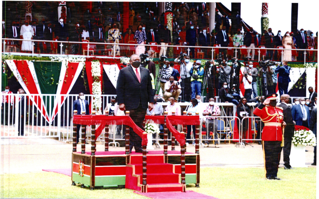
H.E. President Uhuru Kenyatta President of Republic of Kenya and Commander-in-Chief of the Defence Forces during Jamhuri Day Celebrations at the Nyayo National Stadium on 12 December 2020

3.10 The MoD also performed ceremonial duties, which included National Days' celebration parades, ASK Shows, reception and provision of security to visiting dignitaries and Heads of State.