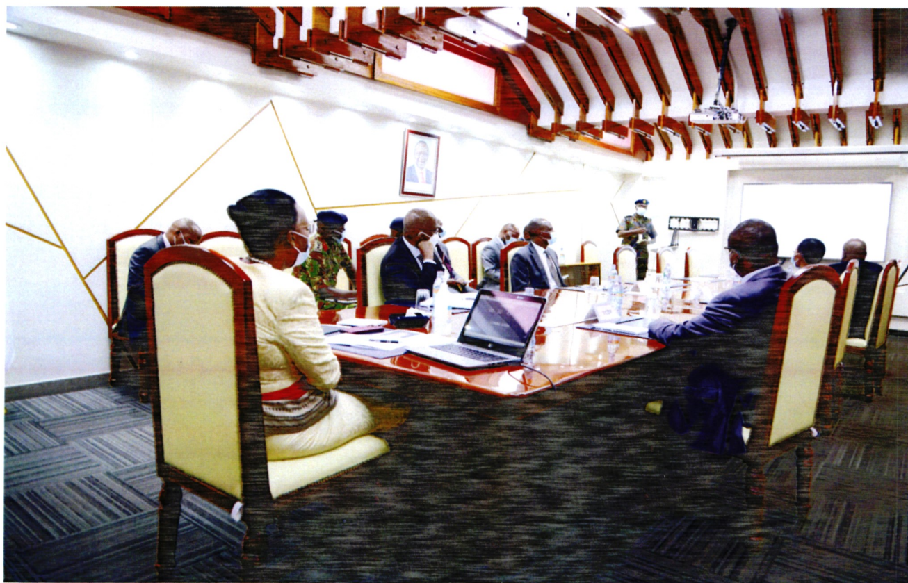
CS Defence Amb. Dr. Monica K Juma presiding over the launch of the upgraded MoD website on 10 April 2021

3.12 Information Management. The Ministry upgraded its website from the previous one that had been overtaken by current web technologies. The new system is secure and provides MoD with an online platform for informing the public on issues happening within the Ministry. The website is more informative, interactive and meets the demands of modern technology.