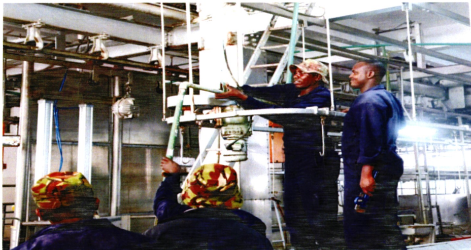
Kenya Defence Forces Engineers at the Kenya Meat Commission repairing the water supply system that supplies clean water to the killing flow area at the Factory.