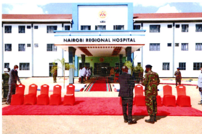
Ongoing preparations for the commissioning of Nairobi Regional Hospital at Kahawa Garrison on 14 October 2021.