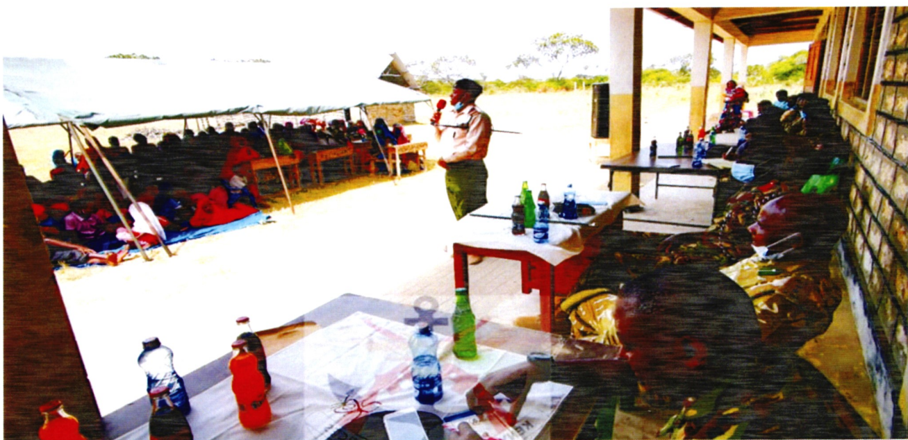
A security officer addressing a multi-agency security team in Lamu on 22 June 2021

3.7 On the multi-agency approach to security, the Ministry continued to collaborate with all the stakeholders including Parliament, Ministries, Departments and Agencies to achieve its mandate. In this regard, therefore, KDF collaborated with the Ministry of Interior and Coordination of National Government by conducting its primary role in Deep, Close, Operation Amani Boni (OAB) and Ops Rejeshu Utulivu resulting in major outcomes that had positive impact on National security. Other operations included manning of multi-agency roadblocks in Isiolo, Garissa and Kilifi Counties, among other areas.