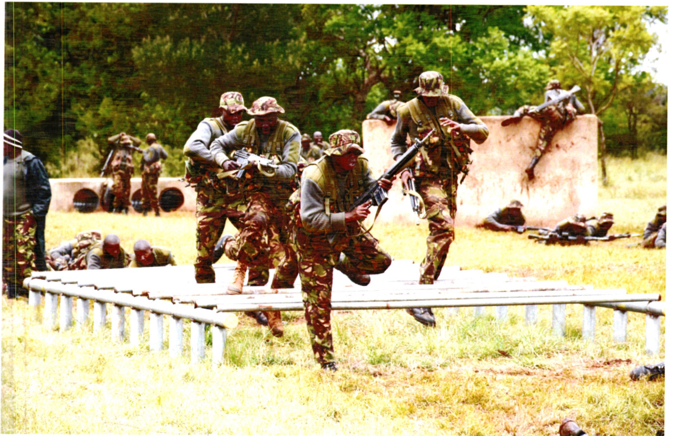
KDF recruits undergoing military training at the Recruits' Training School (RTS), Eldoret.