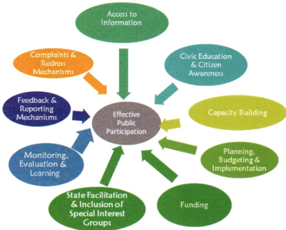
Figure 1: Kenya's KPPP: Key Policy Areas