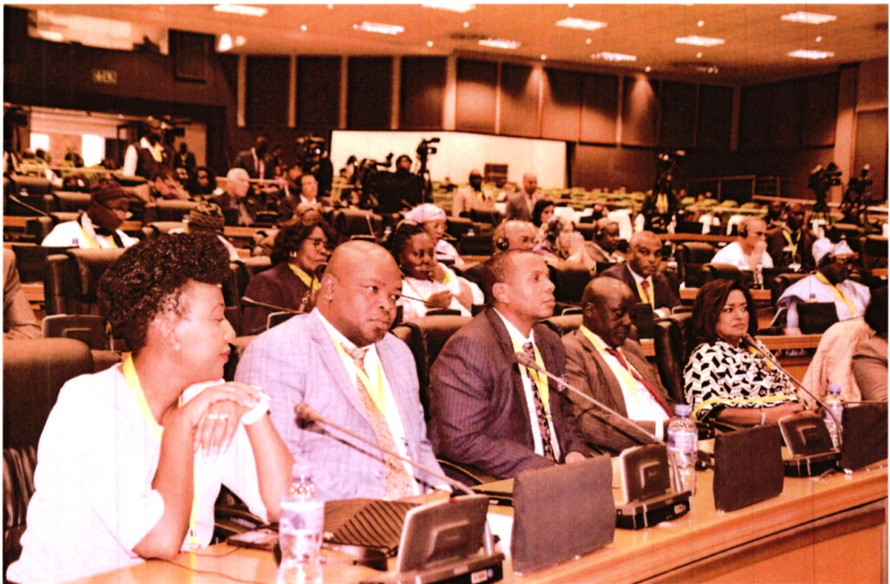
Members of the Delegation keenly follow proceedings during the Climate Change Summit (held on 16 th & 17 th May, 2023) where H.E. President (Dr.) William Ruto, CGH, Commander-in-Chief of Kenya Defense Forces, was the Chief Guest