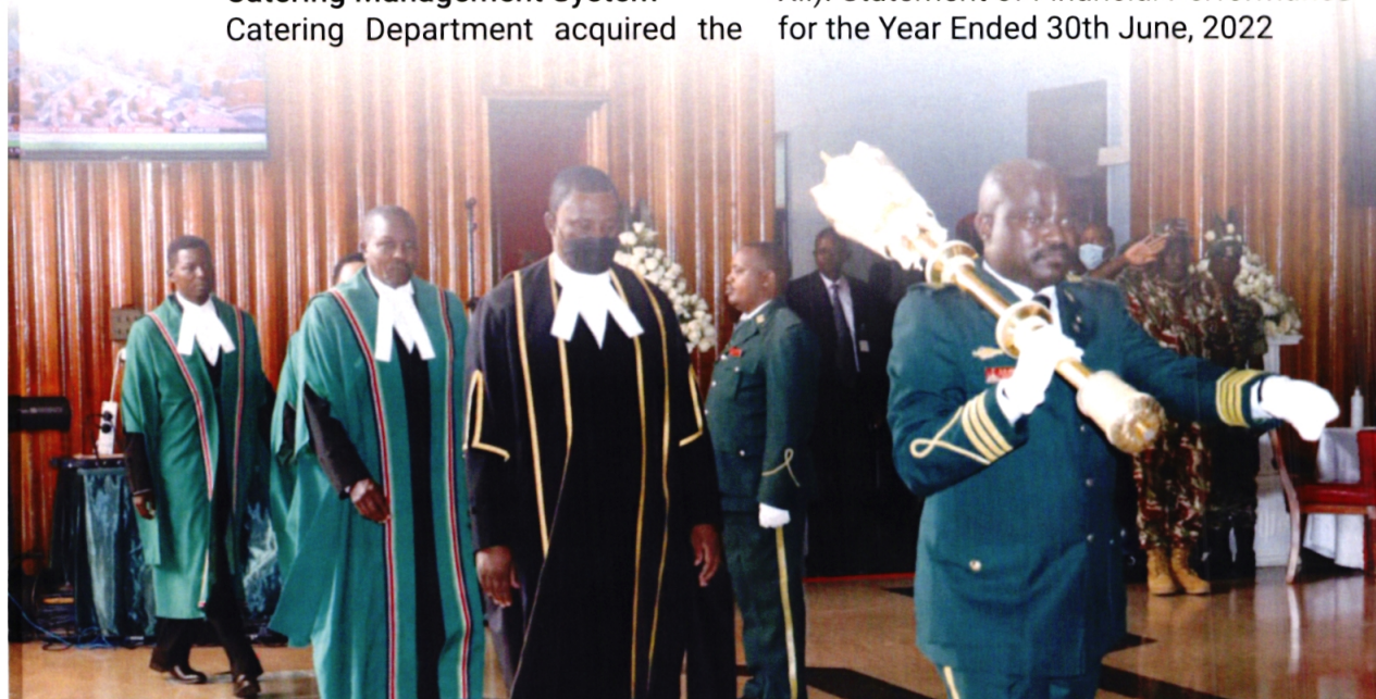
The Speaker of the National Assembly in the 12th Parliament the Hon. Justin Muturi, EGH, MP and his Senate Counterpart, the Rt. Hon. Kenneth Lusaka lead the Members of the Parliament Leadership in bidding farewell to the body of the the 3rd President of the Republic of Kenya, the late H.E. Mwai Kibaki, C.G.H., which lay in State in Parliament after his demise on 21st April 2022.

Xii). Statement of Financial Performance for the Year Ended 30th June, 2022