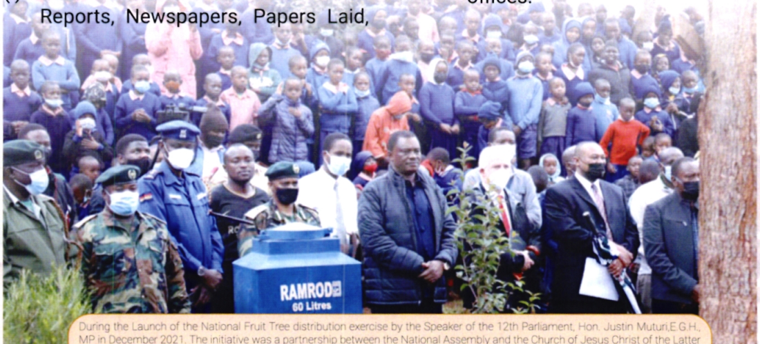
During the Launch of the National Fruit Tree distribution exercise by the Speaker of the 12th Parliament, Hon. Justin Muturi, E.G.H., MP in December 2021. The initiative was a partnership between the National Assembly and the Church of Jesus Christ of the Latter Day Saints