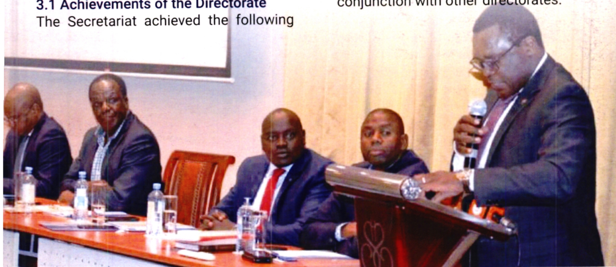
The Speaker of the Senate, Rt Hon Kenneth Lusaka has lauded as 'significant', a consultative meeting between counterpart committees of the Senate and the Council of Governors (CoG).