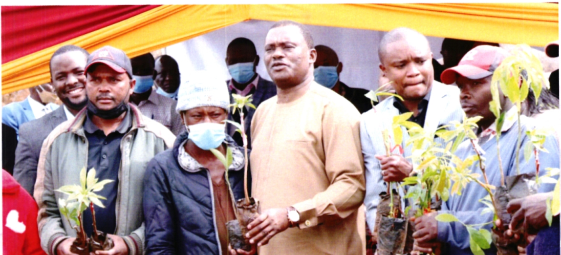
The Speaker of the 12th Parliament Hon. Justin Muturi distributes fruit tree seedlings to residents of Molo Constituency during an event of the Opening of KMTC College in Eiburgon Molo on the invitation of area MP Hon. Kimani Kuria in January 2021. The distribution of the seedlings was part of the Fruit Tree Planting drive launched by the Speaker in December, 2021.