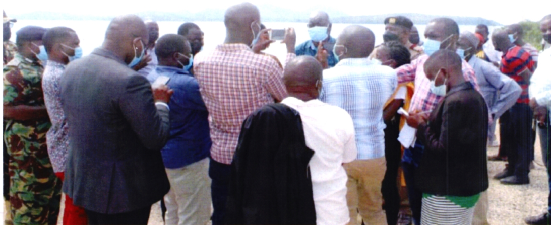
Media coverage during a fact-finding visit to Homa Bay Pier by the National Assembly Departmental Committee on Administration and National Security.

During the period under review, Departmental Committees considered two hundred and sixty-eight (268) Questions and eighty three (83) Statements. One hundred and seventy-three (173) Questions were processed and responded to before Departmental Committees. Similarly, seventy four (74) responses to requests for Statements by Members were processed to conclusion.