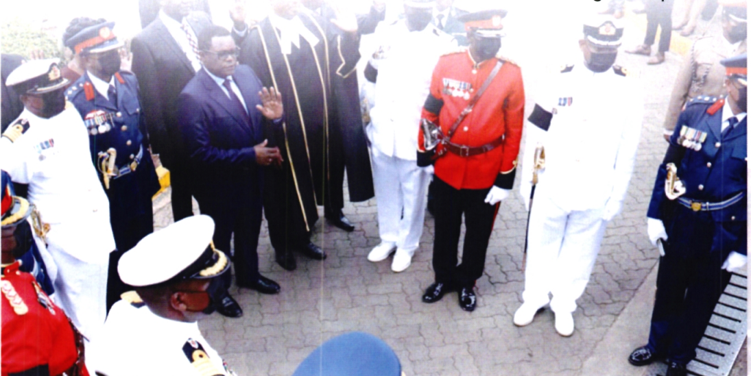
The Speaker of the National Assembly in the 12th Parliament the Hon. Justin Muturi, EGH, MP and his Senate Counterpart, the Rt. Hon. Kenneth Lusaka lead the Members of the Parliament Leadership in bidding farewell to the body of the the 3rd President of the Republic of Kenya, the late H.E. Mwai Kibaki, C.G.H., which lay in State in Parliament after his demise on 21st April 2022.

The Directorate has effectively manned all the accesses to main Parliament buildings for personnel