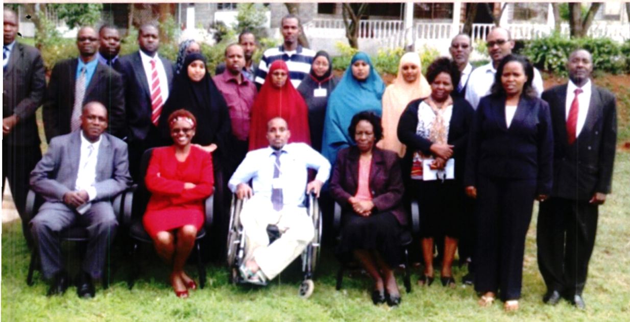
The Kenyan delegation to the 140th Inter-parliamentary Union (IPU) led by Speaker of the Senate, Rt Hon Kenneth Lusaka has called for urgent international action in support of southern African countries hit by Cyclone Idai