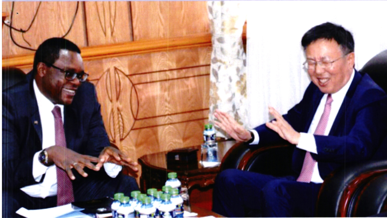
The Speaker of the Senate, Rt Hon Kenneth Lusaka met the new Chinese Ambassador to Kenya, HE Amb Wu Peng who called on him at Parliament Buildings.

There was refurbishment of six (6) Senators’ offices located at the KICC building; Red Cross building and KDF residence situated at the new wing of the main building.