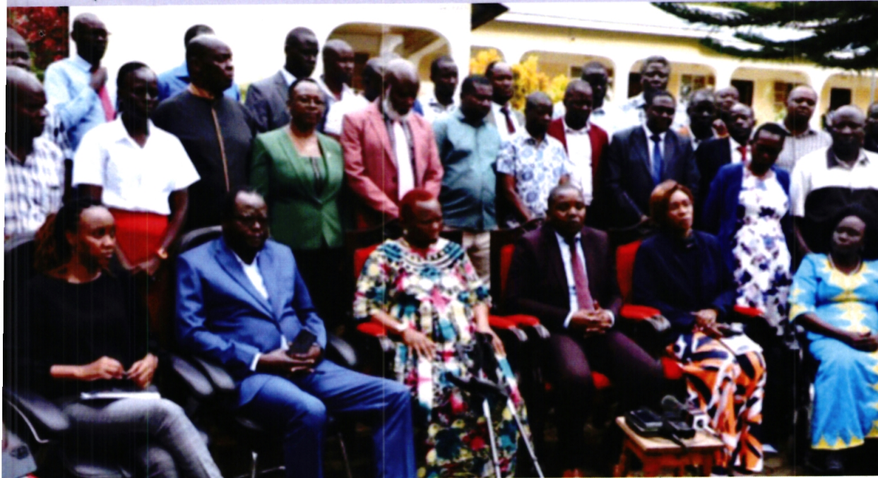
Members of the Senate National Cohesion, Equal Opportunity and Regional Integration Committee on a visit to Migori County Assembly

a total of thirteen (13) Bills were published and introduced in the Senate by way of 1st reading. Together with other legislative proposals introduced earlier, three (3) Bills were assented to, twenty-six (26) Bills were passed and referred to the National Assembly and not concluded, while twenty-two (22) Bills were pending before the Senate by the time the Senate proceeded on Sine Die Recess on 21st June, 2022.