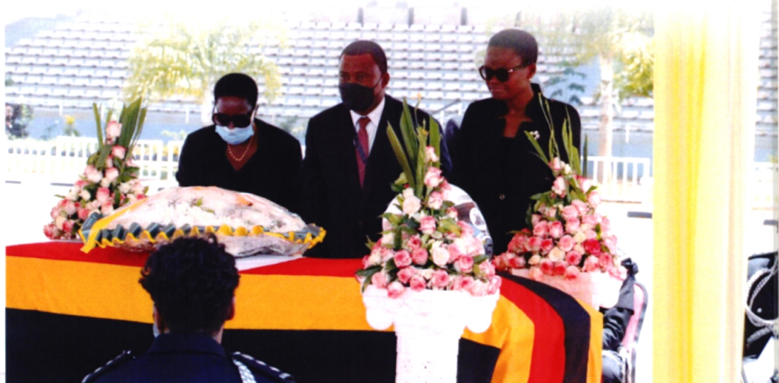
The Speaker of the 12th Parliament Hon. Justin Muturi, E.G.H., MP, lays a wreath on the casket containing the remains of former Uganda Speaker, the late Hon. Jacob Oulanyah. He is flanked by the Speaker of the National Assembly of the United Republic of Tanzania (right) the Rt. Hon. Dr. Tulia Ackson and the Deputy Speaker of Burundi National Assembly Hon. Sabine Ntakarutimana. The Speaker represented the Republic of Kenya in the national funeral service held in 6th October, 2020.

The Directorate of Departmental Committees plays a significant role in facilitating the realisation of a number of strategic objectives of the Parliamentary Service Commission Strategic Plan of 2019 to 2030.