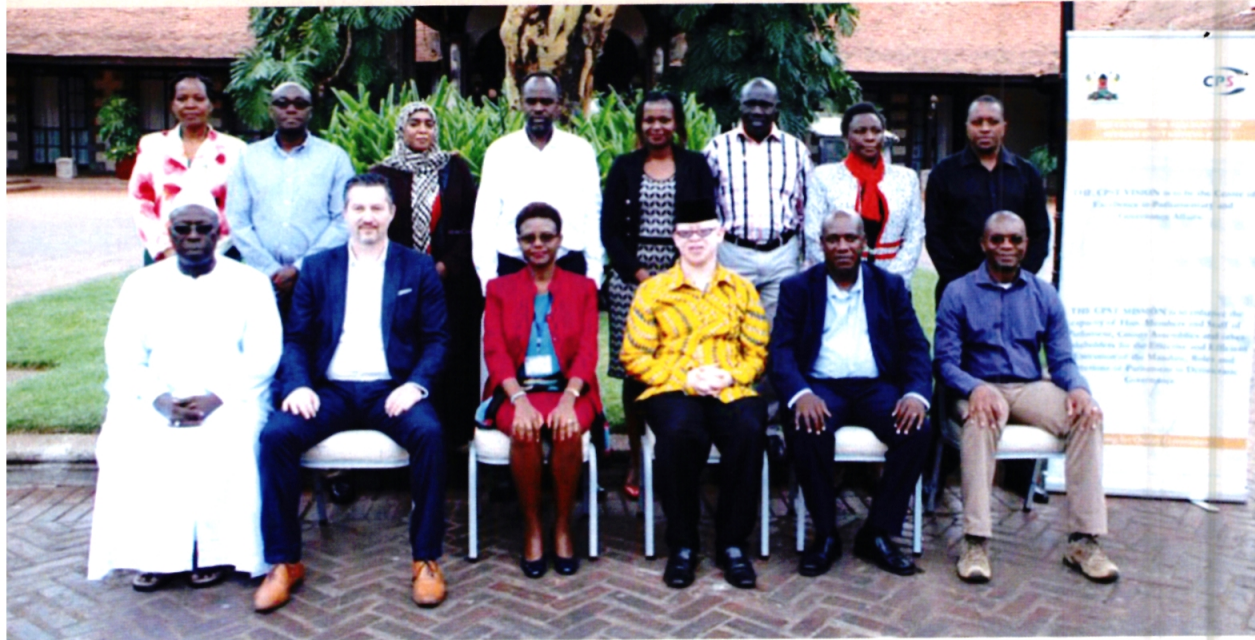
Intermediate Hansard Training for County Assembly at Lake Naivasha Sawela Lodge