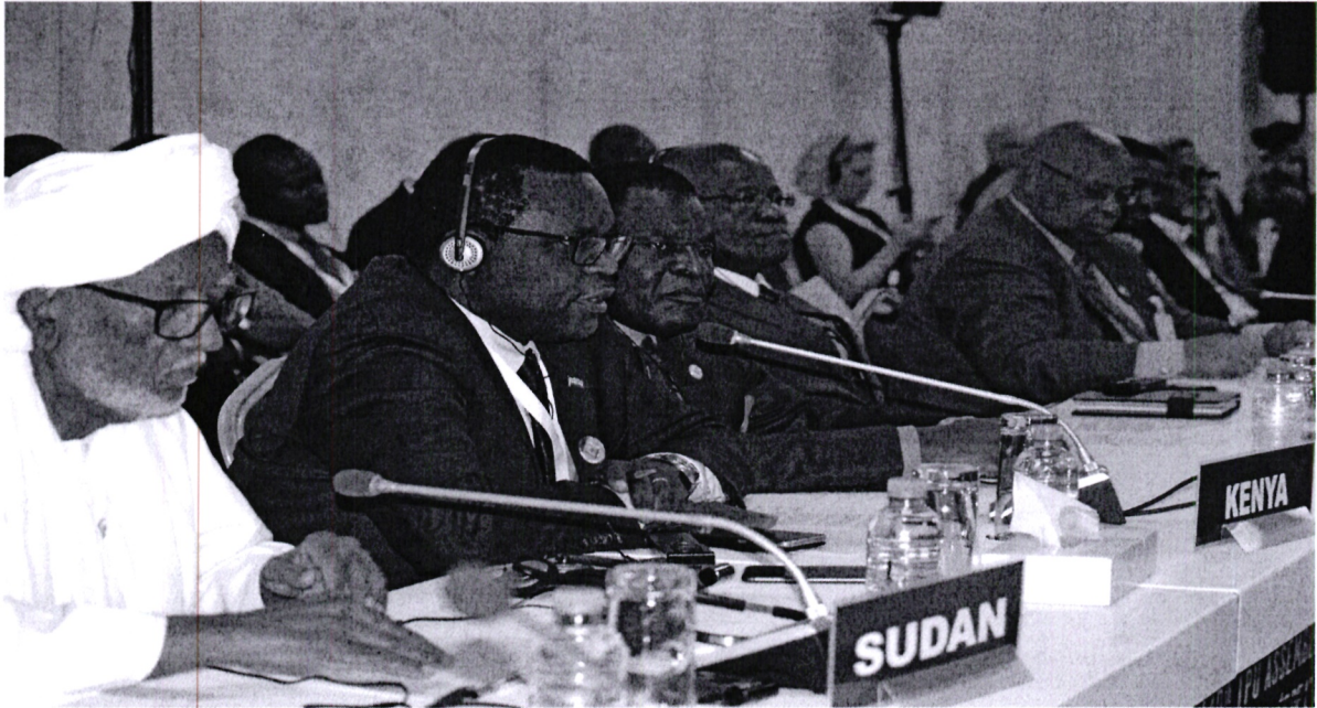
The Rt. Honourable Speaker of the Senate, Sen. Kenneth M. Lusaka, MP together with Amb. Paddy C. Ahenda, the Ambassador of Kenya to the Kingdom of Qatar during a Speaker's Round Table meeting at the 140 th IPU Assembly