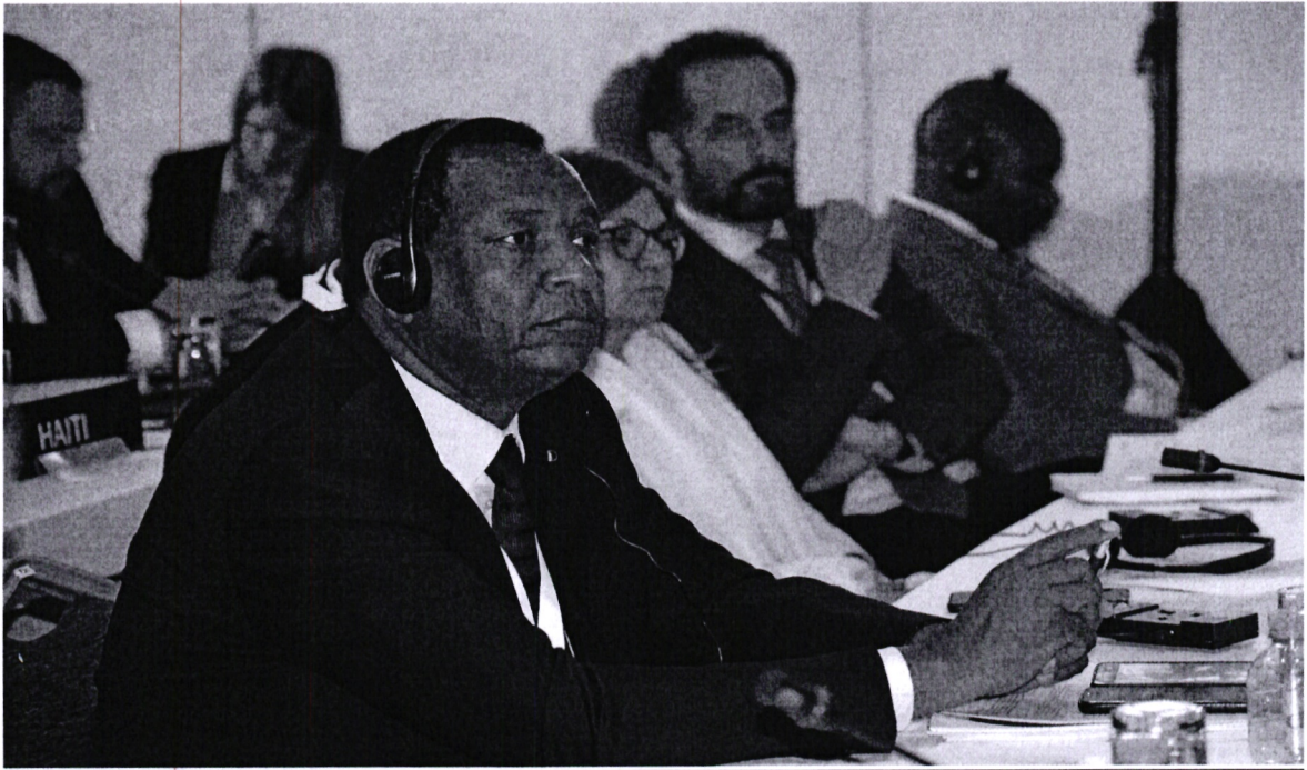
Hon. Vincent Kipkurei Tuwei, MP following the proceedings of the Standing Committee on Sustainable Development, Finance and Trade