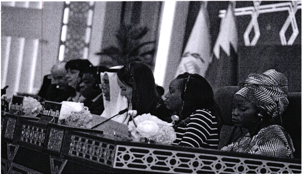
Sen. Susan Kihika, MP and Chairperson of the Bureau of the Women Parliamentarians together with the IPU Leadership during the opening of the Assembly