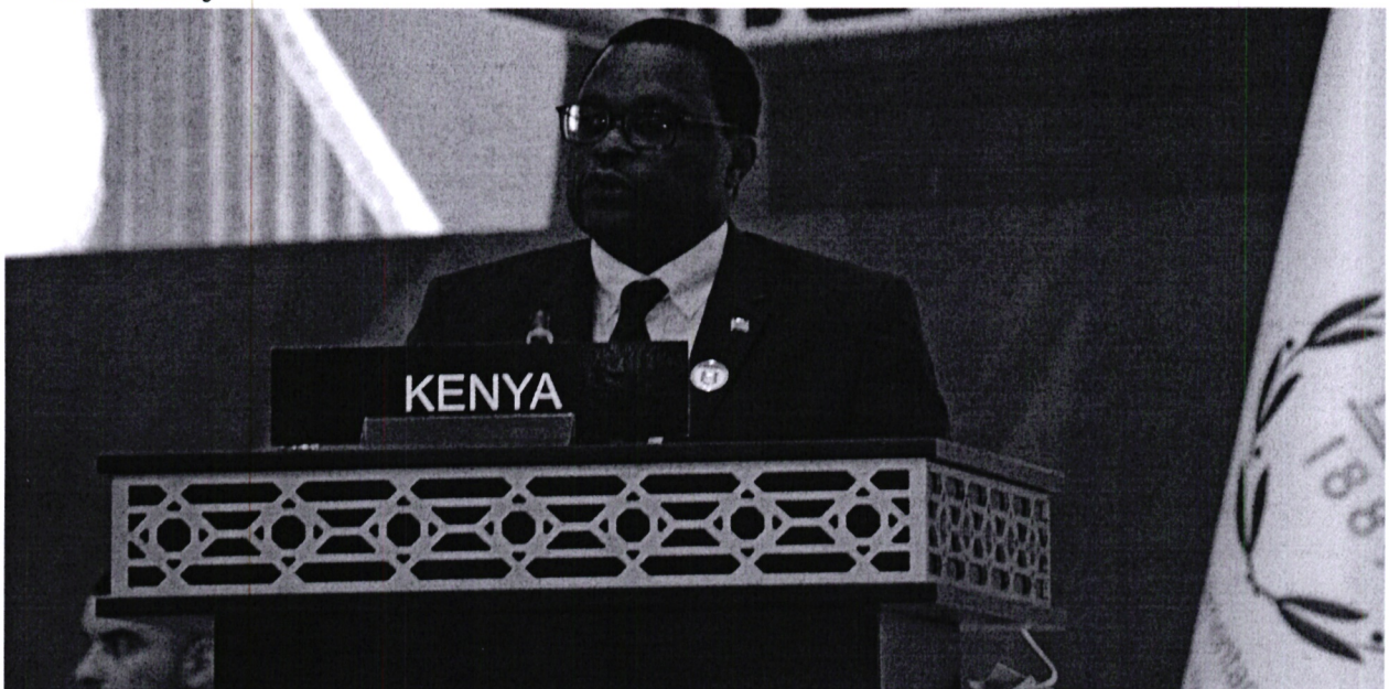
The Rt. Honourable Speaker of the Senate, Sen. Kenneth M. Lusaka addressing the 140 th IPU Assembly