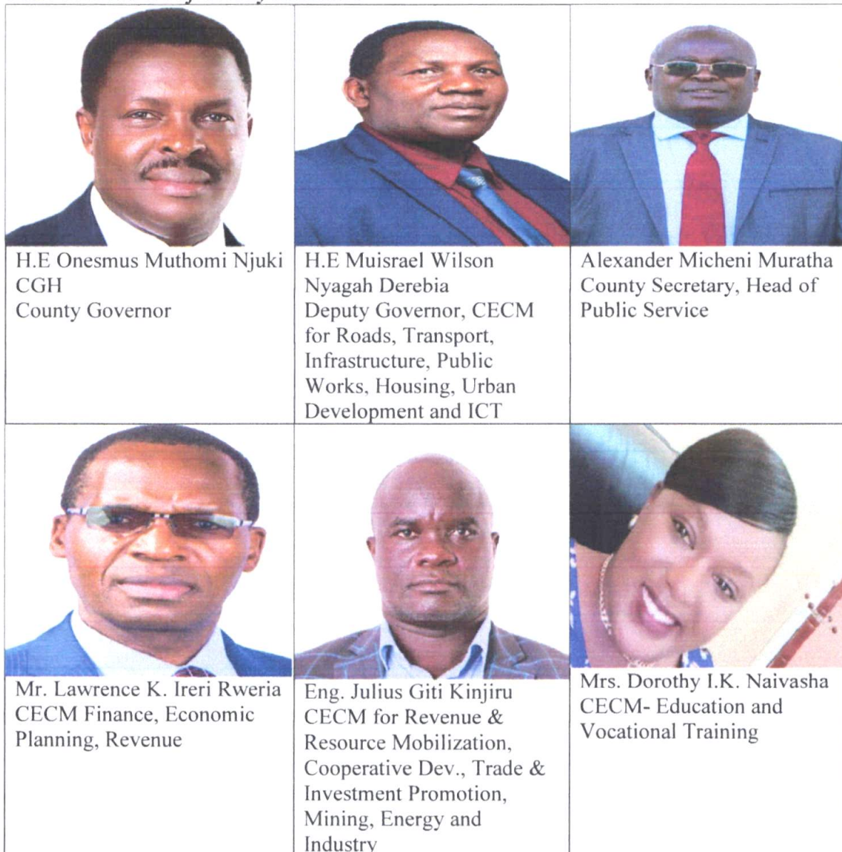
Table 5: Members of County Executive