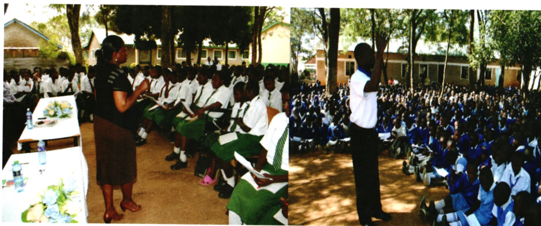
EACC Officers sensitizing students from St. Anne Kisoko Girls School in Busia County and pupils from Bungoma DEB Primary School in Bungoma County.