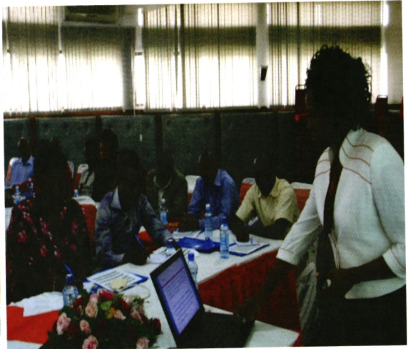
Integrity Club Patrons posing for a photo and an EACC Officer making a presentation during the Integrity Club Patrons training held in Kisumu.