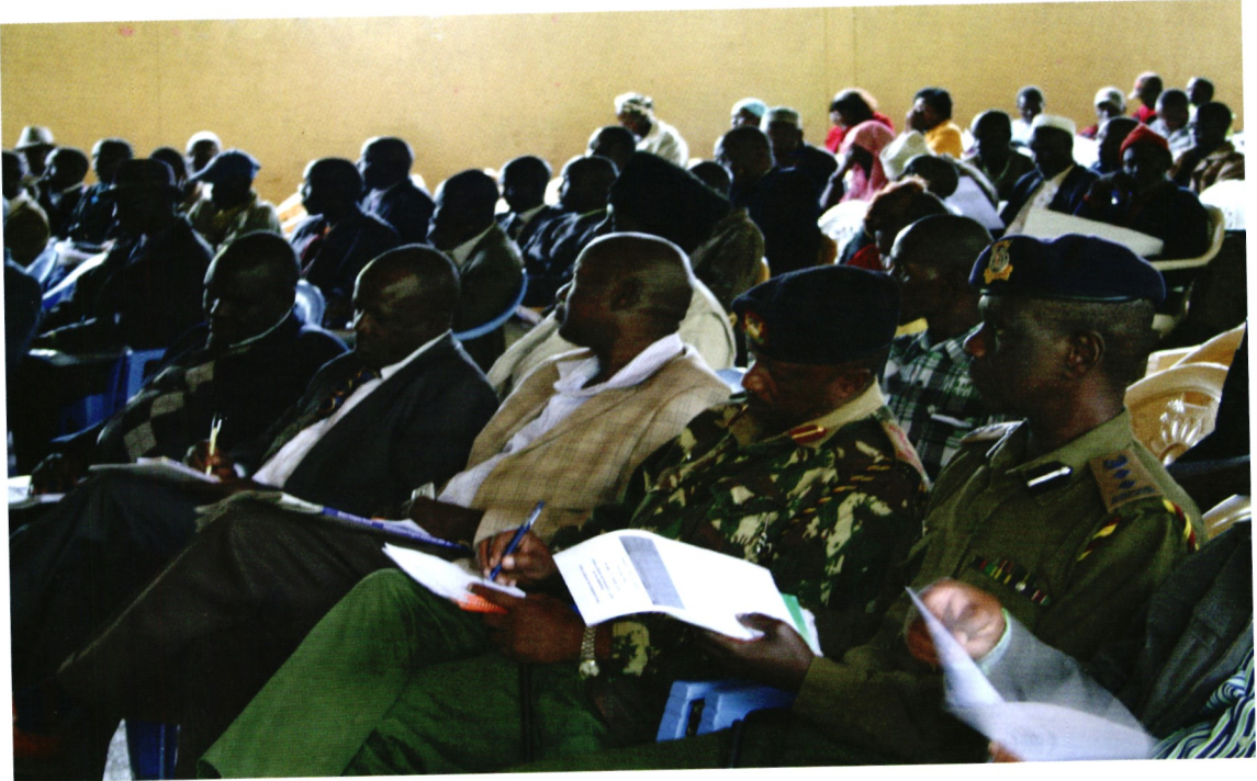
Participants at the County Leadership and Integrity Forum in West Pokot County