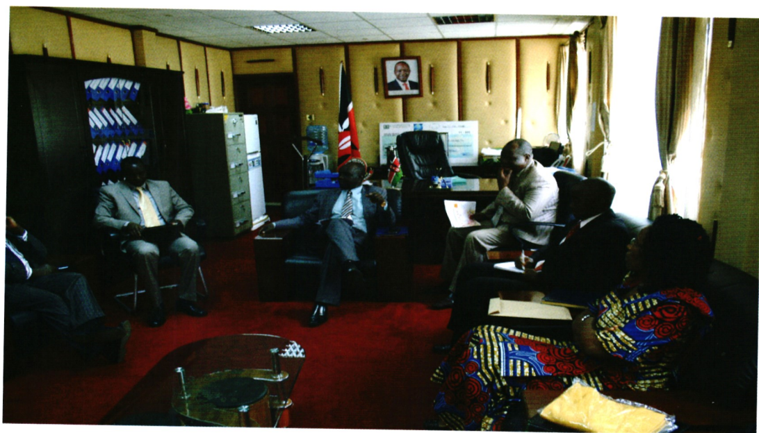
KLIF stakeholders pay a courtesy call to the West Pokot Governor

The process of developing the Kenya Integrity Plan (KIP) which is a successor to the National Anti-Corruption Plan (NACP) commenced during the year under review.