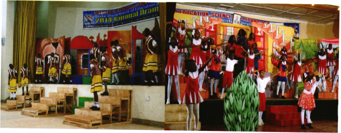
Some of the pupils performing during the 2014 Kenya National Drama Festivals which was held in Nyeri County.