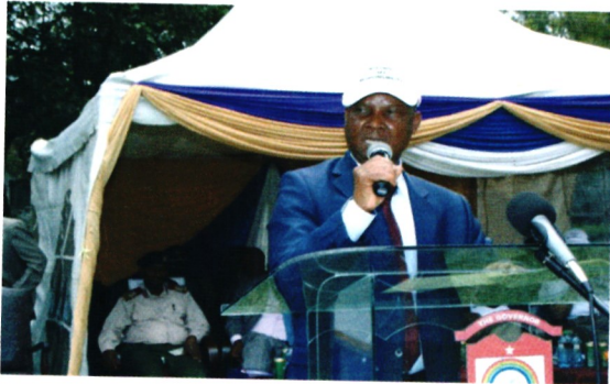
Nakuru County Governor Kinuthia Mbugua addressing the participants