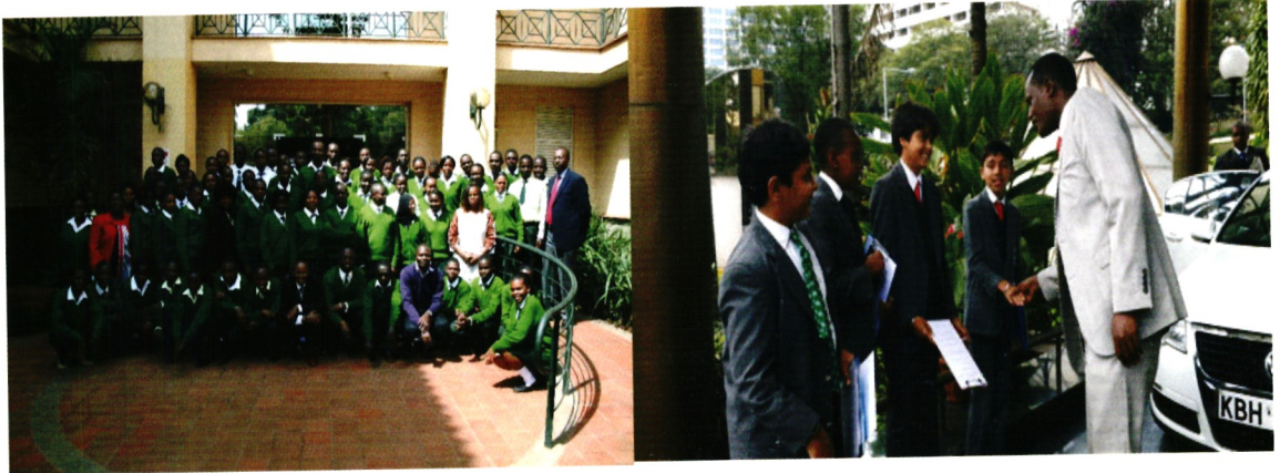
Integrity Club Members from Egoji TTC and pupils and from Aga Khan Junior School visited the Commission.