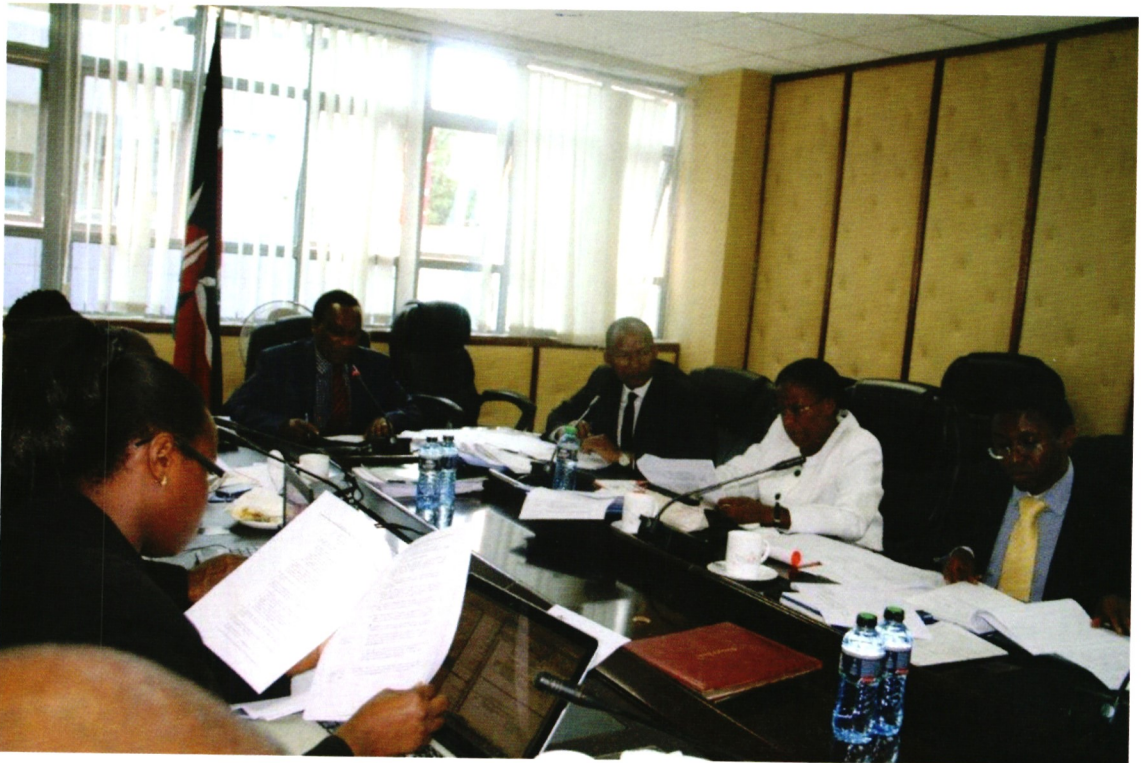
Consultations with CIC on the Draft Leadership and Integrity Regulations 2014 held on 6 March 2014

The Commission developed draft Leadership and Integrity Regulations and submitted to Parliament for consideration for approval.