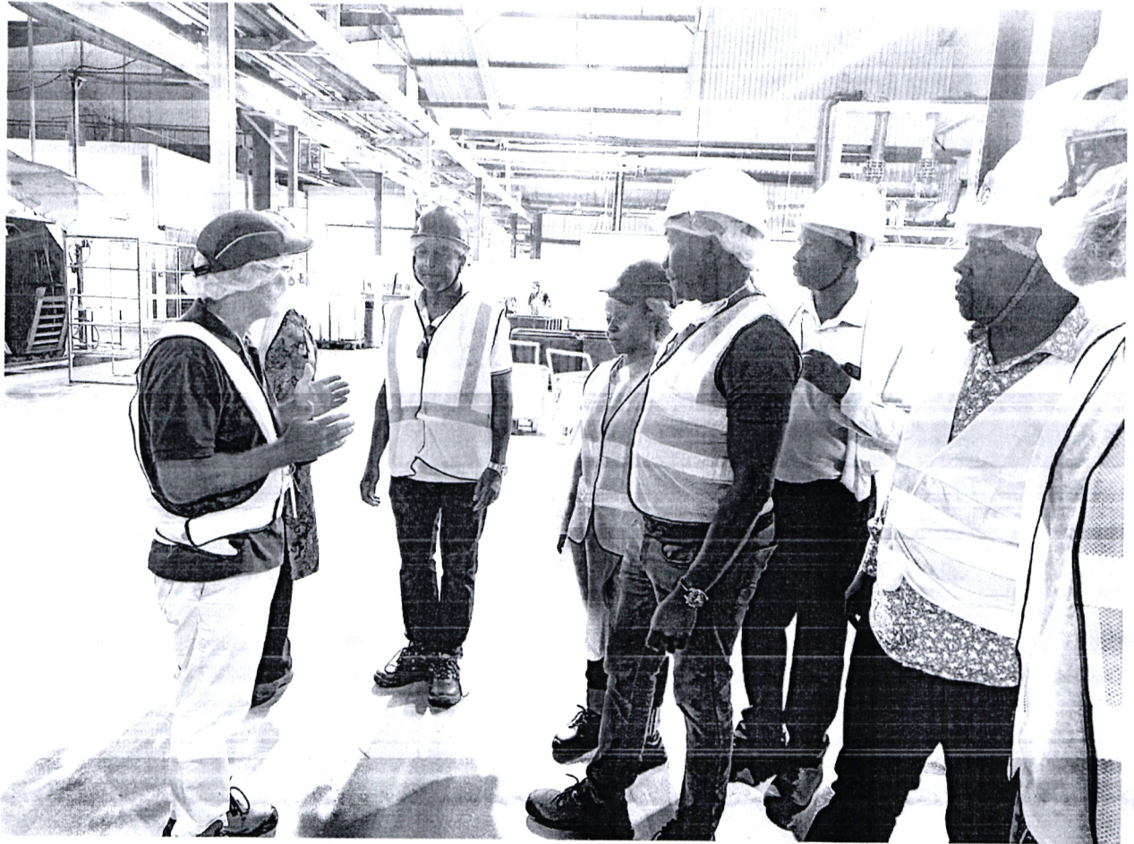
Members of the Delegation at the Indian Ocean Tuna Ltd Fish Processing Plant