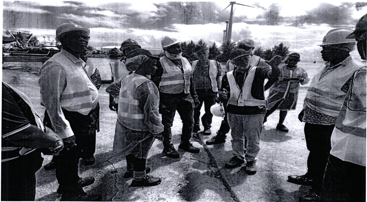
Members of the Delegation with the Principal Secretary, Blue Economy and Fisheries at the Indian Ocean Tuna Ltd