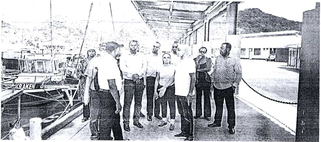
The National Assembly Delegation with the Principal Secretary, Blue Economy and Fisheries at a local fisheries Port in Seychelles