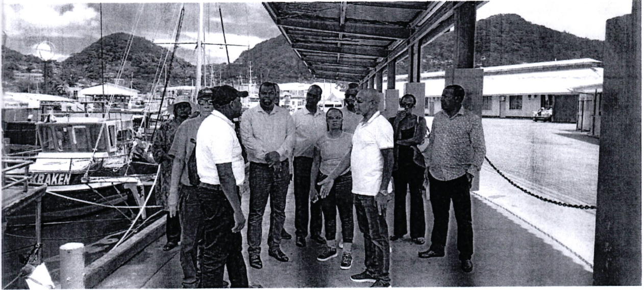
The National Assembly Delegation with the Principal Secretary, Blue Economy and Fisheries at a local fisheries Port in Seychelles