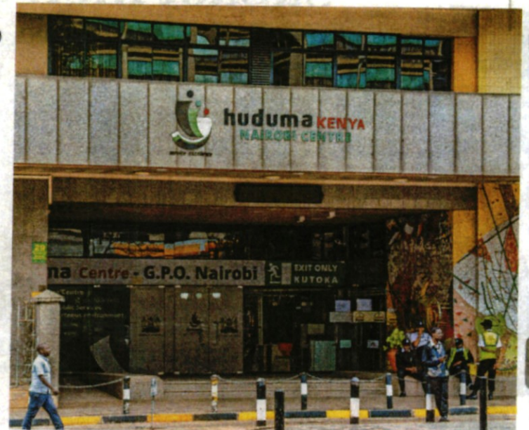
Huduma Centre at GPO Nairobi in a photo taken yesterday. The government is targeting an additionion in non-tax revenue to supplement tax revenues in the current financial year. DENNIS

Consequently, the State has moved to increase fees or fines on land transactions, college education, replacement of IDs, processing of passports, and fines on minor traffic offences.