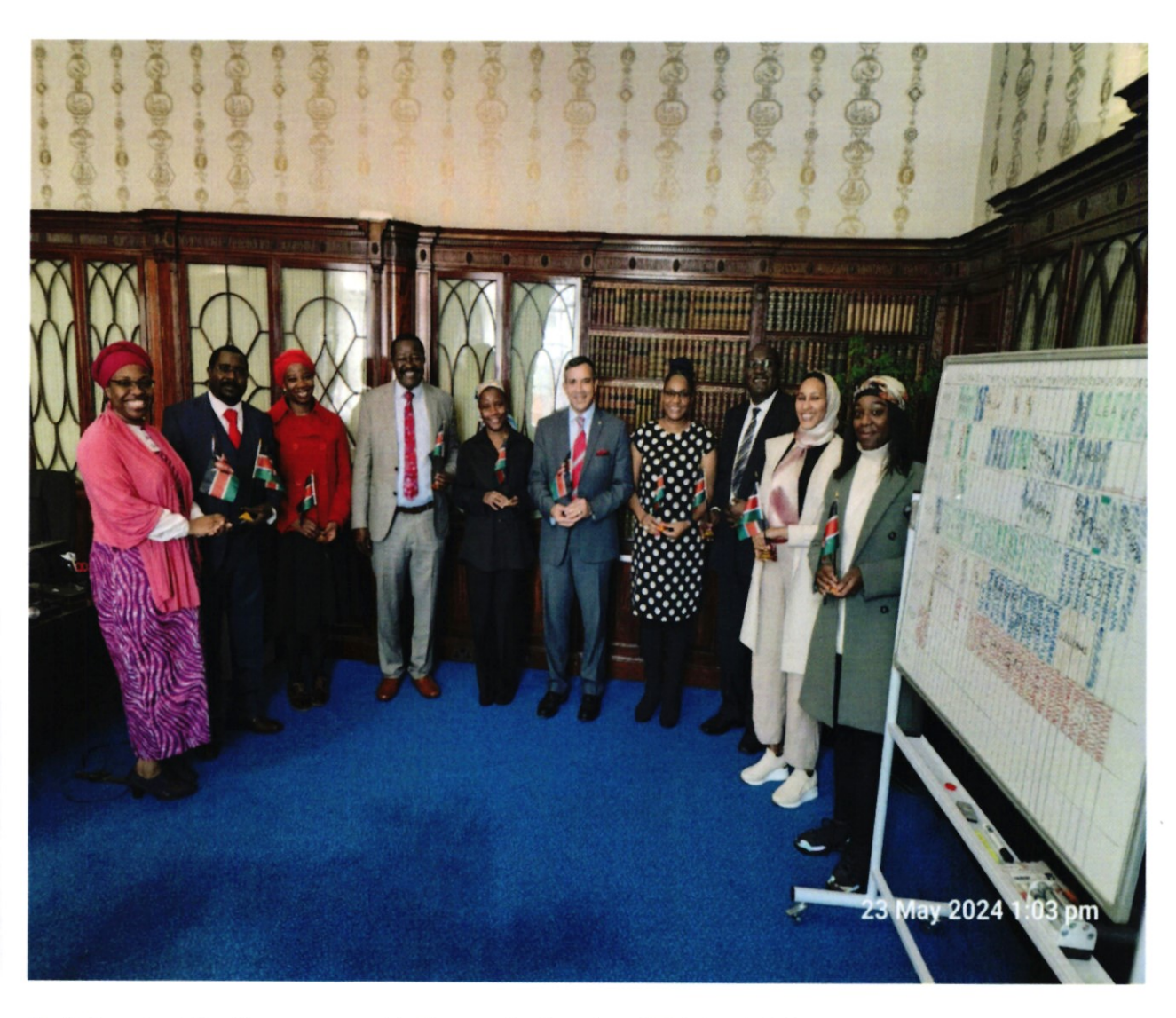
Participants at the Commonwealth Secretariat London UK May 2024