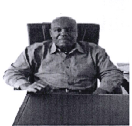
Key achievements in the FY 2022/2023