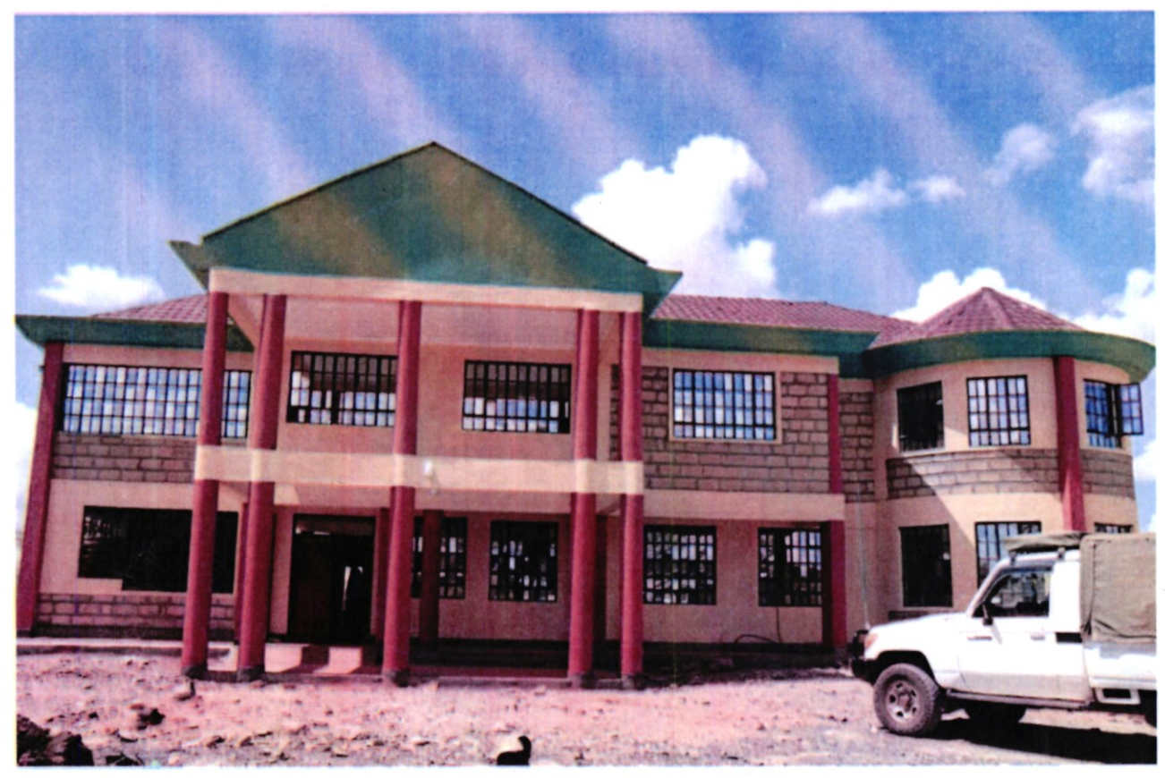
Figure 1:Ongoing Construction of NG-CDFC office at Laisamis Sub County HQ

However Much NG-CDFC tries to balance the needs, still more challneges abound. These includes increased needs due to awareness creations, minimal funding, competition over the scarce funds by various projects and communities, political influences from competitors and limited functions. Since NG-CDF is a National Government Fund, it is only allowed by Law to finance National Government functions.