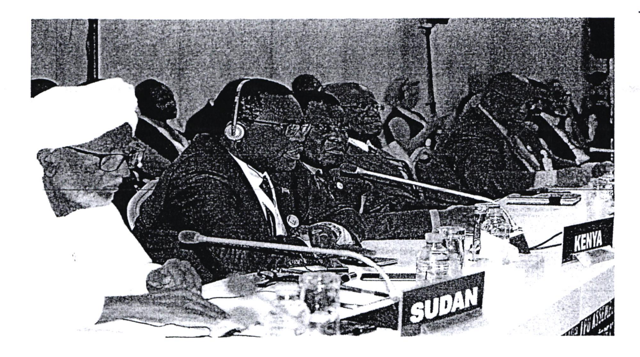
The Rt. Honourable Speaker of the Senate, Sen. Kenneth M. Lusaka, MP together with Amb. Paddy C. Ahenda, the Ambassador of Kenya to the Kingdom of Qatar during a Speaker's Round Table meeting at the 140<sup>th</sup> IPU Assembly