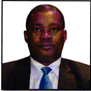
Hon. Justin Muturi, EGH, MP Speaker, National Assembly/Chairman, PSC