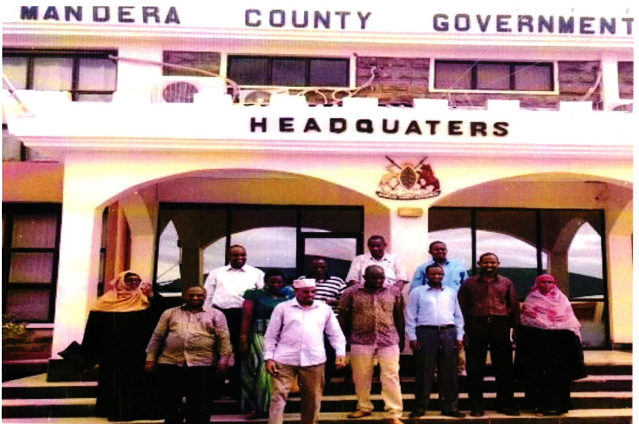
A visit to the Manderla County Assembly by the Senate Leadership