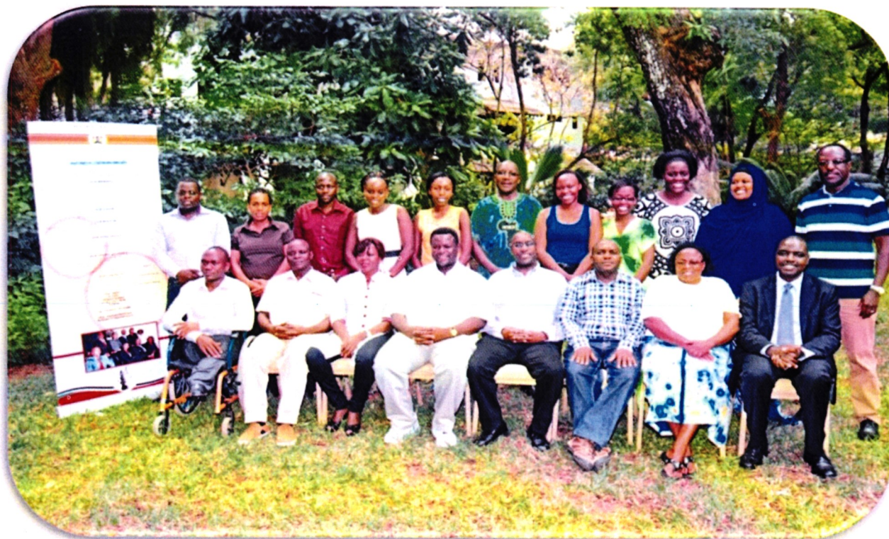
Directorate of Litigation and Compliance Planning Retreat on 20 th – 24 th Jan 2015 at Serena Beach Hotel

The Directorate of Litigation and Compliance Services which falls under the PSC Joint Services is responsible for the provision of non-partisan, professional legal services to the Parliamentary Service Commission, Members and staff of Parliament (both the National Assembly and Senate). The