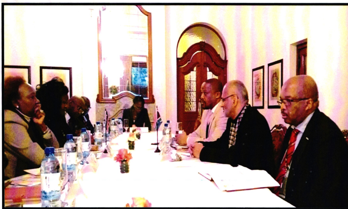
Sen. Beth Mugo (left) and Hon Gladys Wanga at the South Africa Parliament