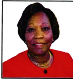
Sen. Beth Mugo, EGH, MP Vice-Chair, PSC