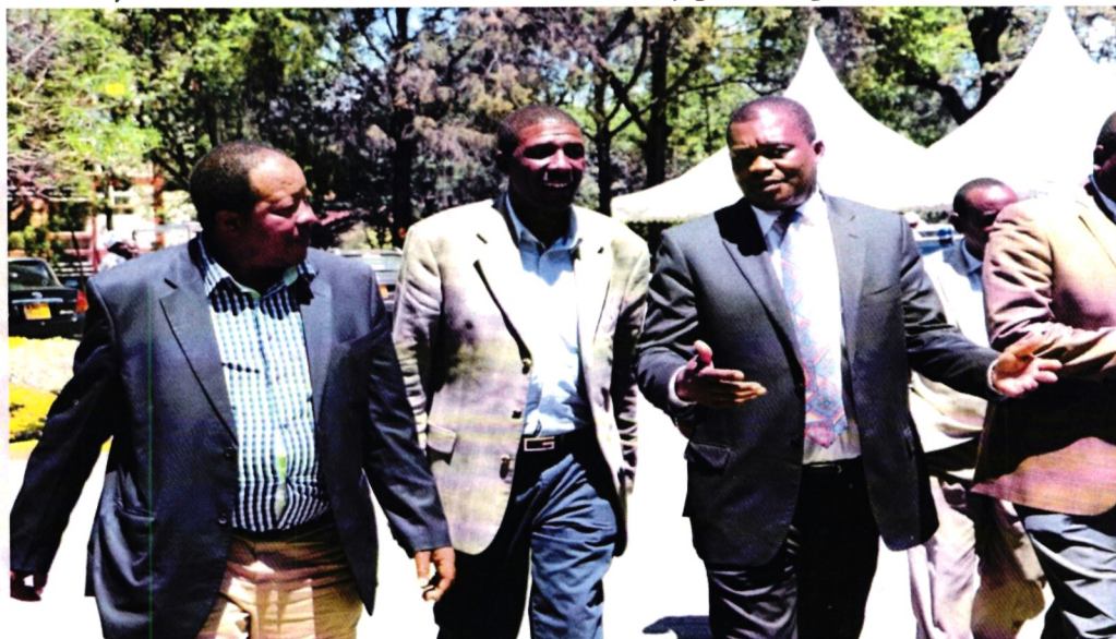
Speaker of the National Assembly Justin Muturi speaks with members of Parliament from Nakuru at a function in the County

The National Assembly comprises of 349 Members of Parliament representing 290 Constituencies, 47 Women elected by Counties and 12 Members nominated by political parties.