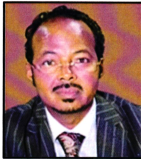
Hon. Adan Keynan, CBS, MP Member