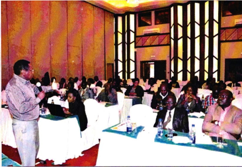
Training Members of Tanzanian Parliament by the CPST

The Centre for Parliamentary Studies and Training (CPST) was established by the Parliamentary Service Commission (PSC) as the capacity building arm of Parliament. The CPST mandate and functions are spelt out in the Legal Notice No. 95 of 22 nd July 2011.