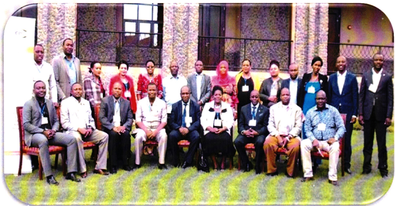
Training Members of Tanzanian Parliament by the CPST