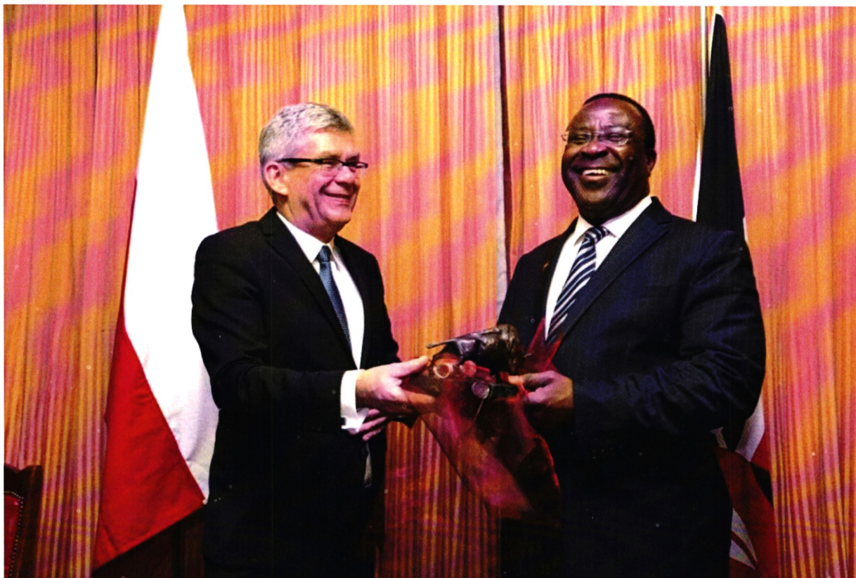
The Marshal (Speaker) of the Senate of Poland, Stanislaw Karczynski and Speaker of the Senate, Sen Ekwere Ethuro share a light moment during a gift exchange ceremony at Parliament of Kenya (November, 2016).

The Speaker is assisted in his duties by the Deputy Speaker, the Leaders of Majority and Minority, the Whips, Chairpersons' Panel and Chairpersons of Committees.