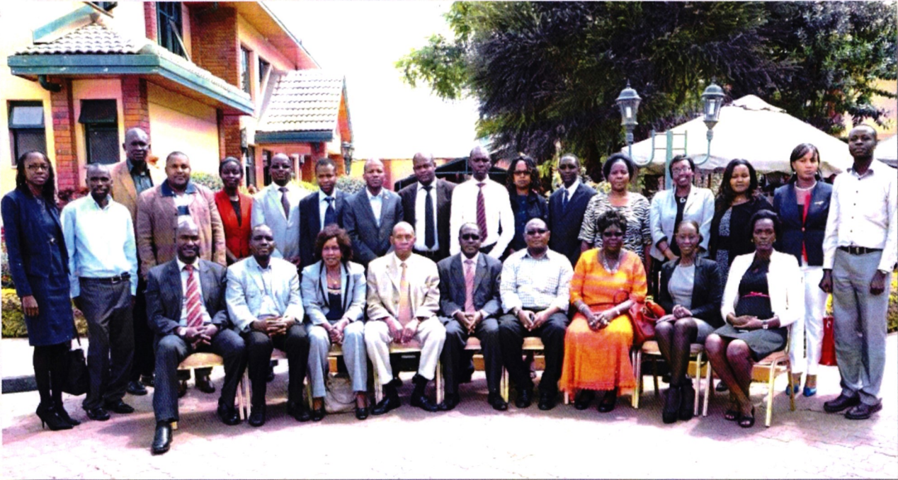
Media officers at an annual retreat 2015

The Department of Media Relations provides information to press and broadcast journalists on the wide-ranging activities of Parliament. It functions to communicate effectively with the public via the media on a diverse range of topics, from publicising parliamentary activities to promoting events at the Parliament of Kenya. The Media Relations contributes towards the operationalisation of Articles 34 (Freedom of the Media), Article 35 (Access to Information) and Article 118 (Public Access and Participation) of the Constitution of Kenya (2010). The Department also facilitates accreditation of journalists and coverage of the Houses of Parliament.