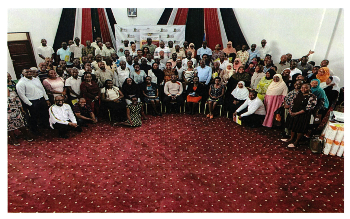
Group Photo with the NGAO's Mombasa County after the sensitization forum done the Victim Protection Board at KSG – Mombasa.