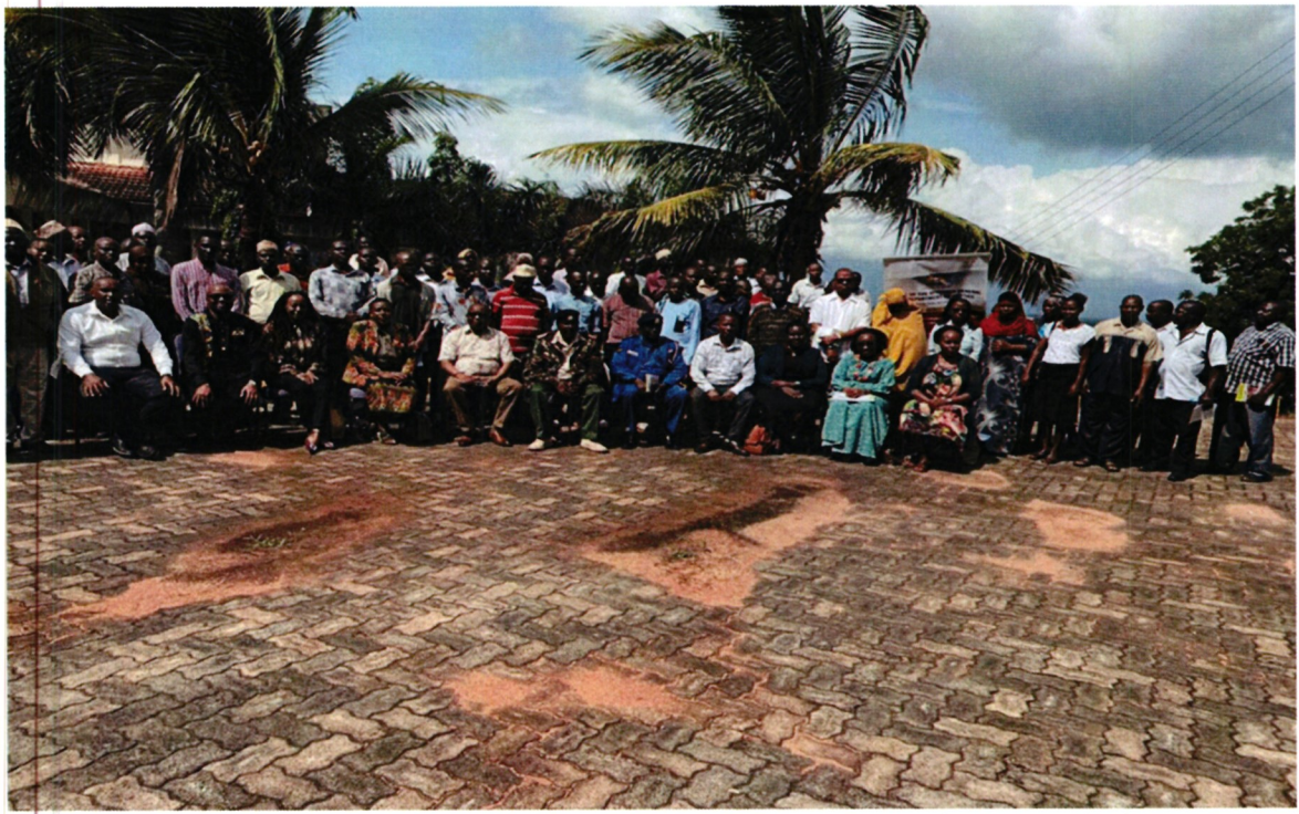
Group Photo with the NGAO participants after the sensitization workshop in Kwale County.