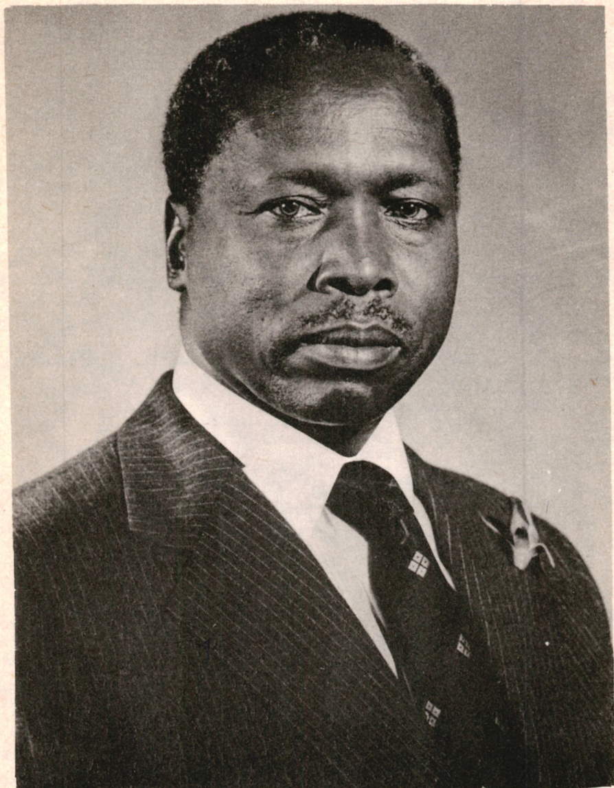
His Excellency Hon. Daniel T. arap Moi, C.G.H., M.P., President and Commander-in-Chief of the Armed Forces of the Republic of Kenya