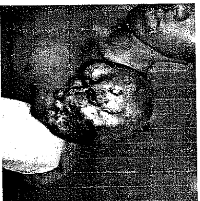
A Cancer patient

Although KNH and the Private Hospital have an agreement to have Poor Patients access the radiation services at