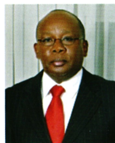
Hon. Prof. Githu Muigai Attorney General