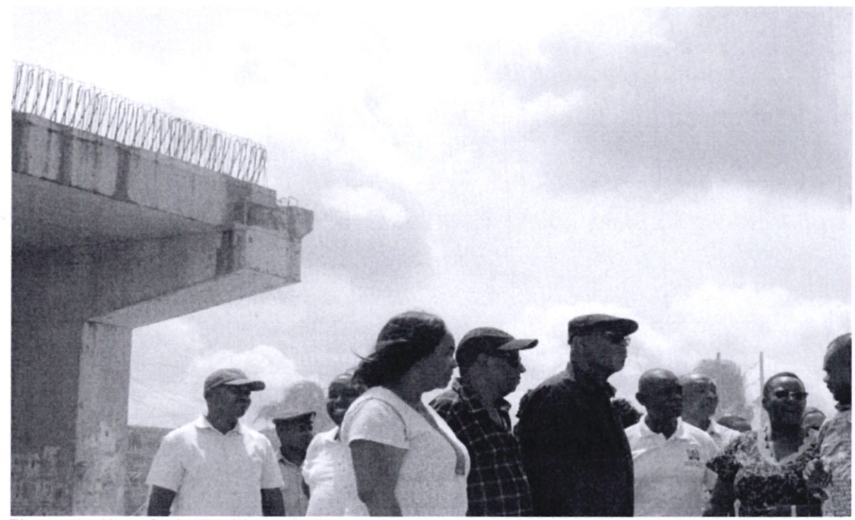
Figure 1: Hon. Bady Twalib, M.P. Jomvu Constituency, taking Members of the Committee on a guided tour of the Mombasa- Mariakani Road