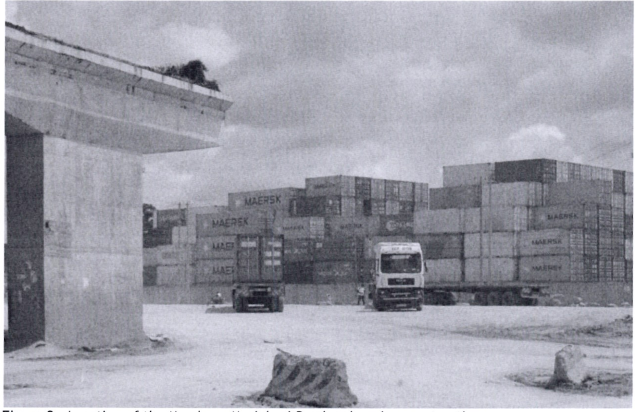
Figure 2: A section of the Mombasa-Mariakani Road undergoing construction.