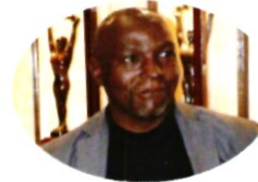
Hitler Ogenche Correctional Services