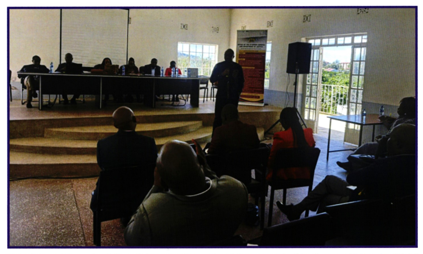
State Counsel from the Office of Attorney General and Department of Justice sensitizing the NGAO in Machakos County on the Victim Protection Act