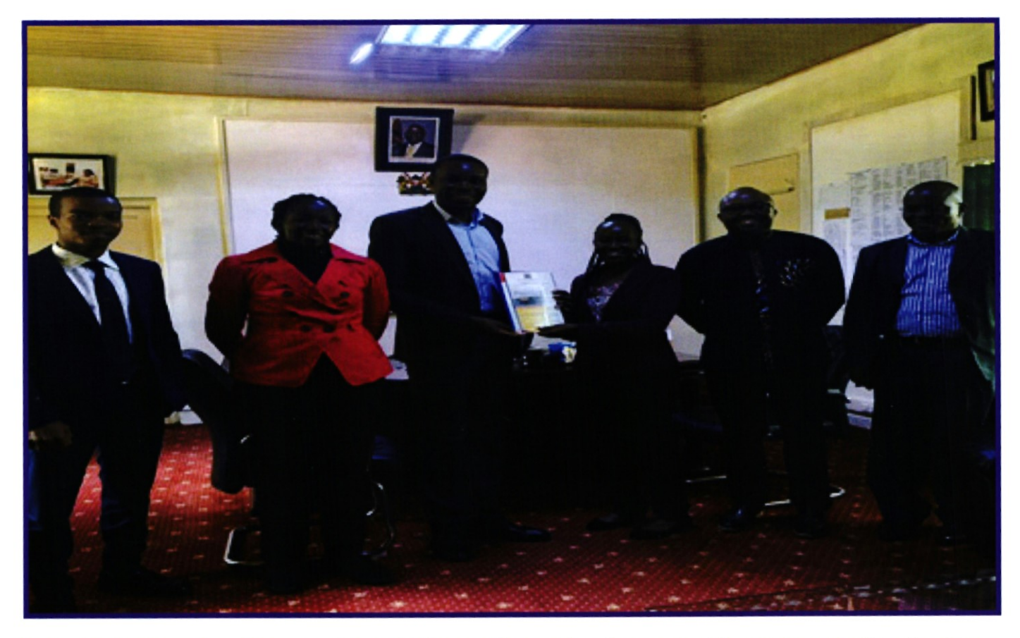
Victim Protection Board Secretariat and Witness Protection Agency paid a courtesy call to the County commissioners office in Machakos County