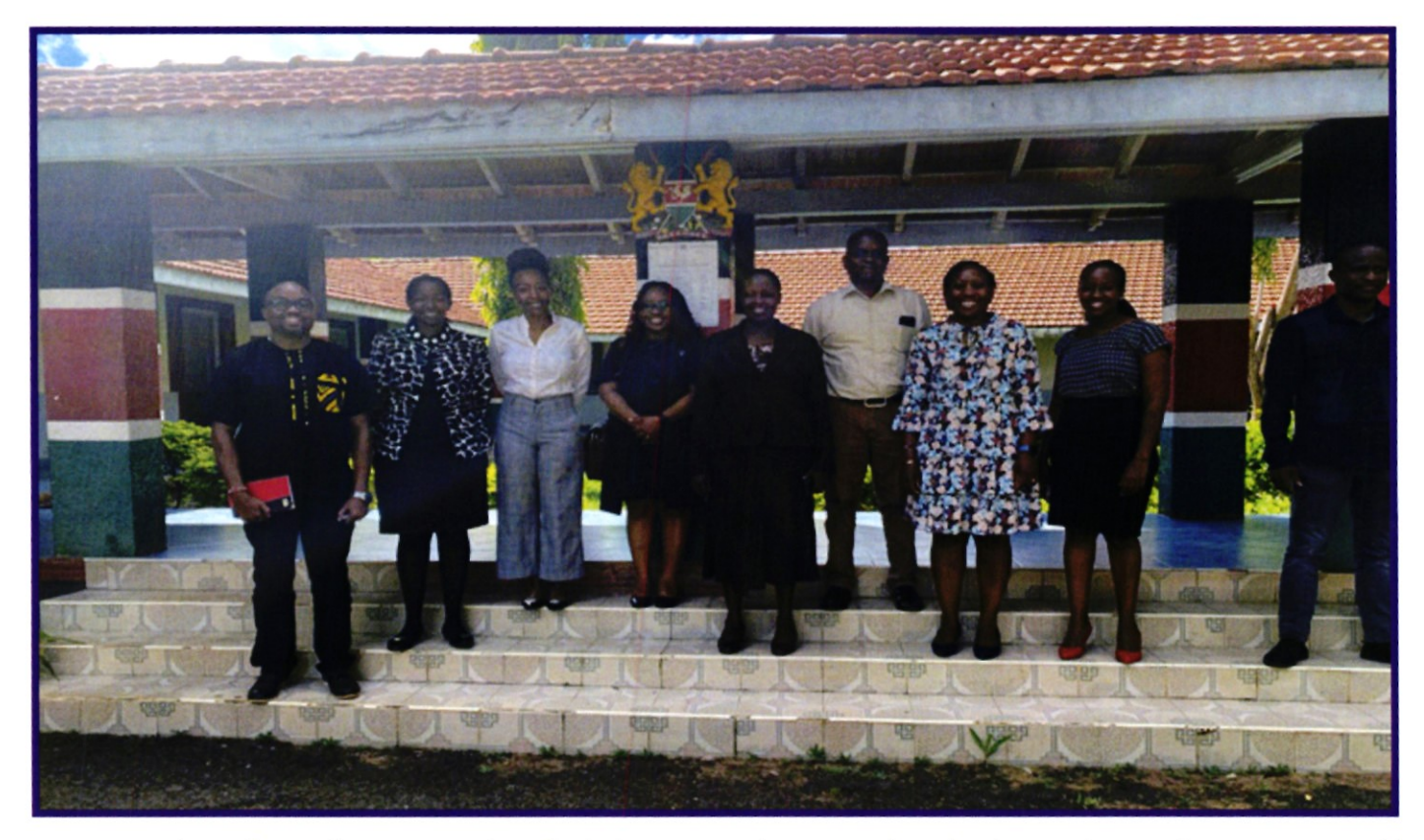
Team members form the secretariat of Victim Protection Board and Witness Protection Agency paid a courtesy call to the County Commissioners Office in Kitui County

Group photo with the opinion leaders in Muranga County, coming from the Religious leaders, Nyumba Kumi leaders, Village elders, CSO, Women leaders, Matatu operators, HRA, Peace partners and Youth leaders