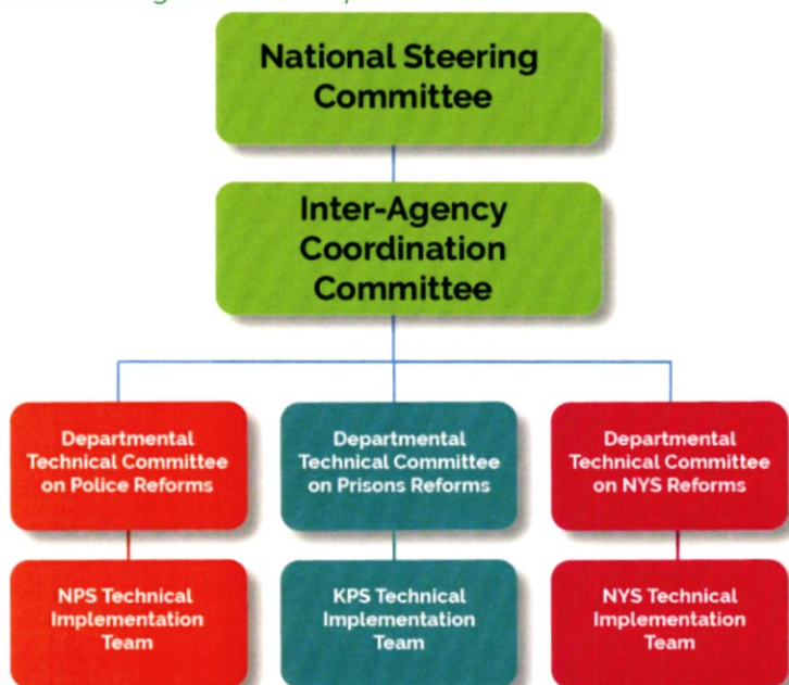
Figure 1: Institutional Arrangement for Implementation

The Cabinet Secretary Public Service will spearhead the overall policy leadership of reforms while the technical leadership role will be provided by the Principal Secretary to support the Director General National Youth Service. The Director General, National Youth Service, will provide the Operational leadership role. The NYS Technical Implementation Team comprising of Directors and Heads of Departments will be responsible to Director General and NYS Council for implementation of the reform agenda.