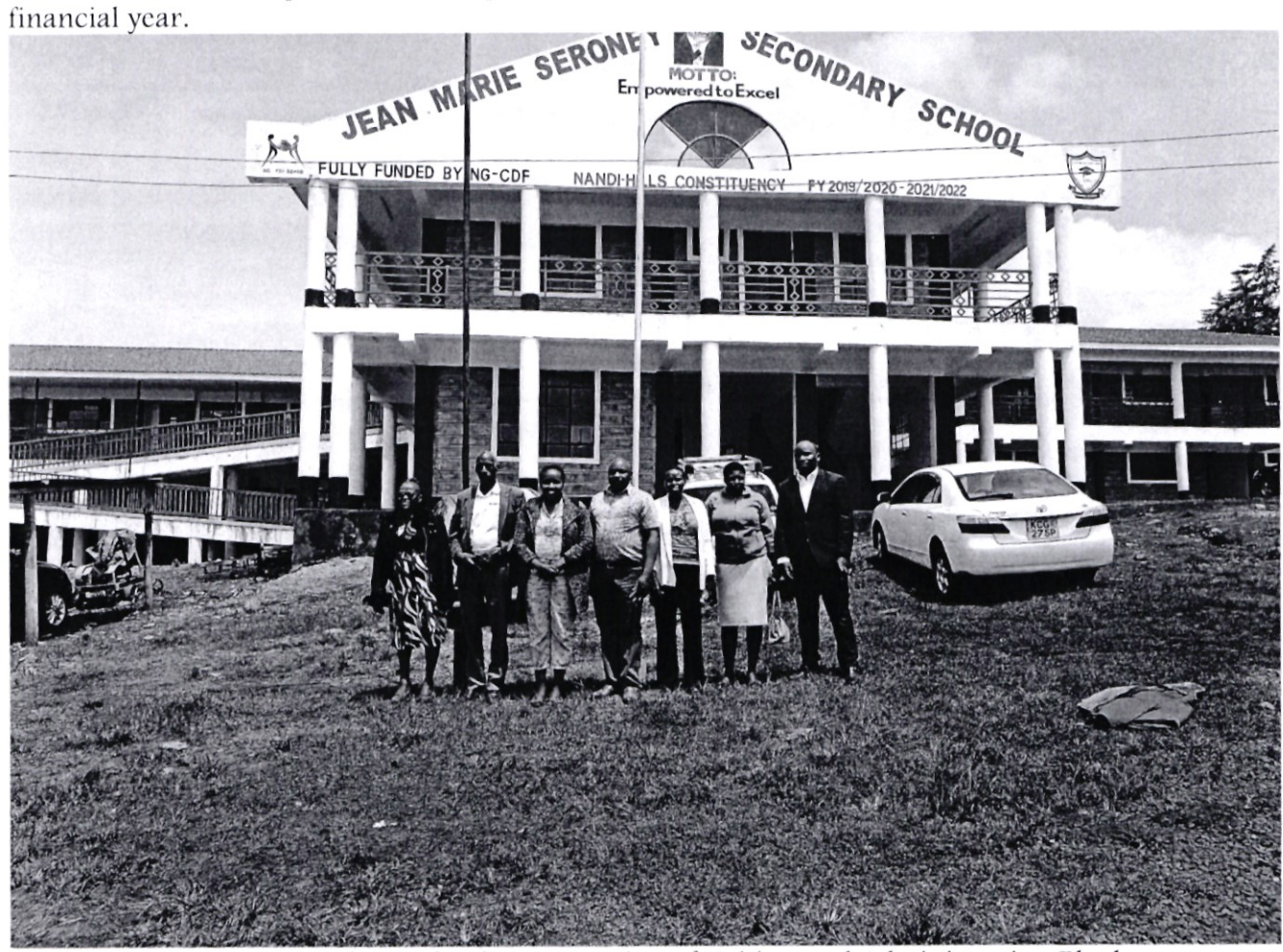
Jean Marie Seroney Secondary School-Construction of Tuition and Administration Block

Herein attached are pictorials to depict some of the successful projects undertaken during the financial year.