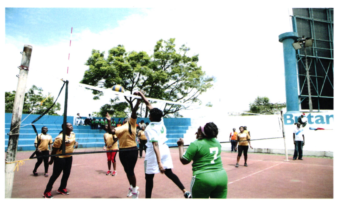
National Assembly and Joint Services on stage