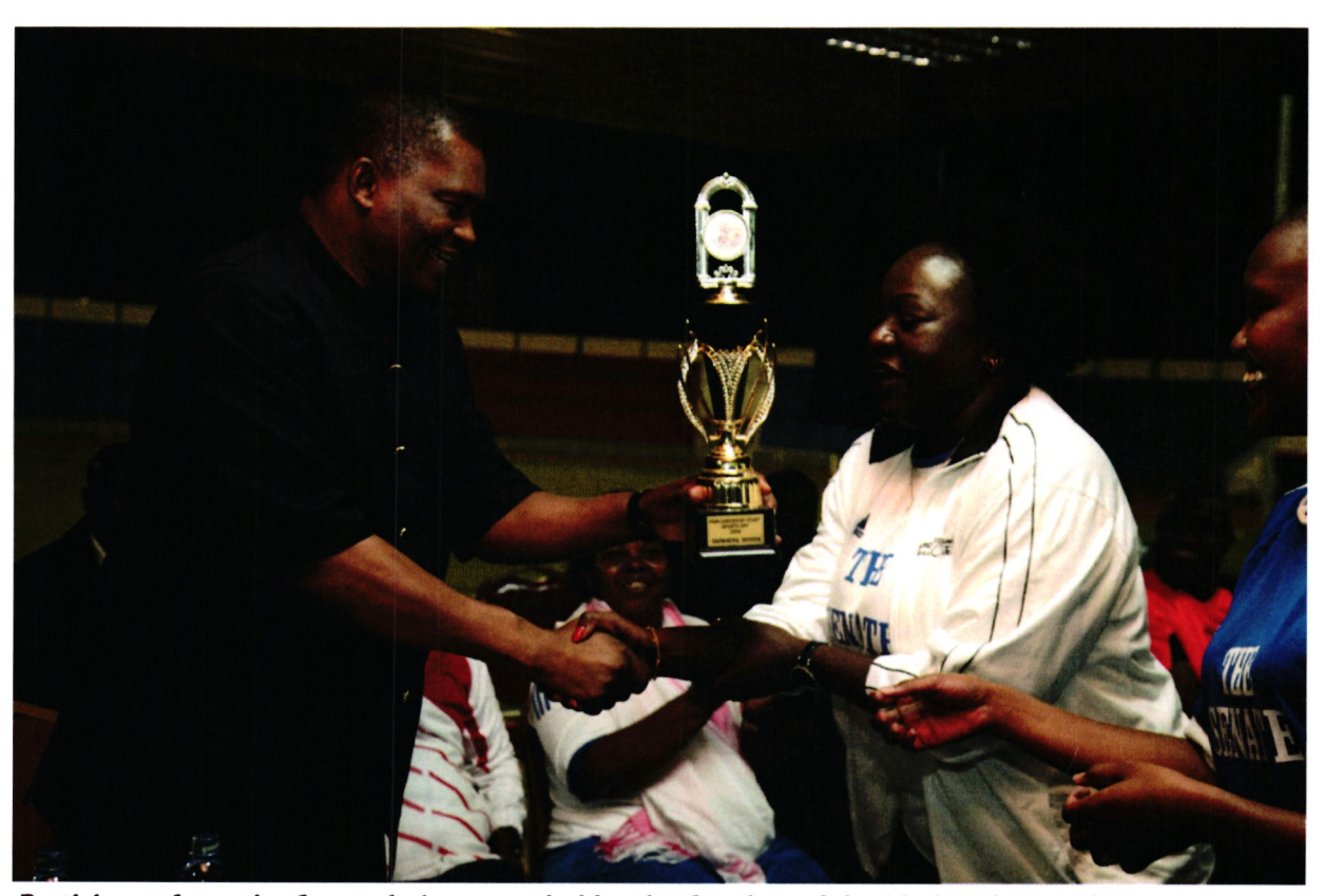
Participant from the Senate being awarded by the Speaker of the National Assembly