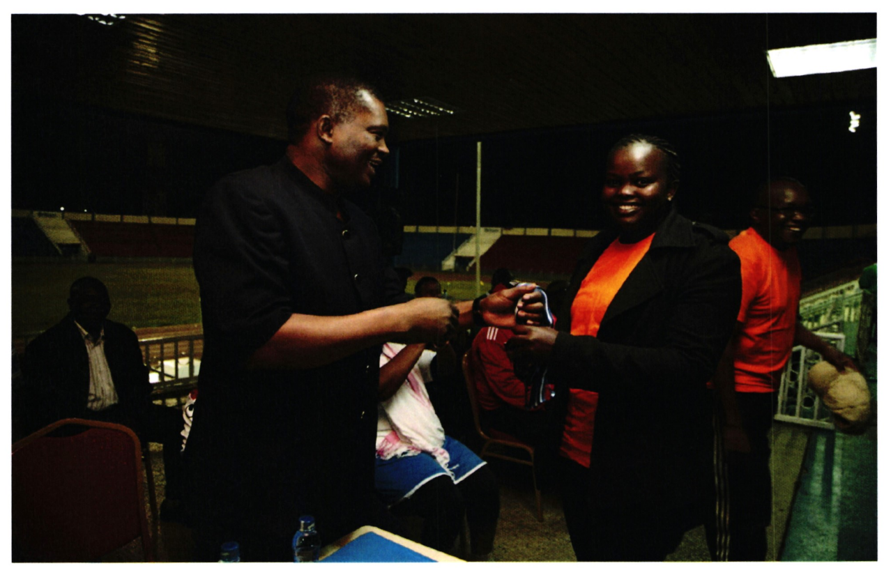
Participant from joint Services awarded by the Speaker of National Assembly