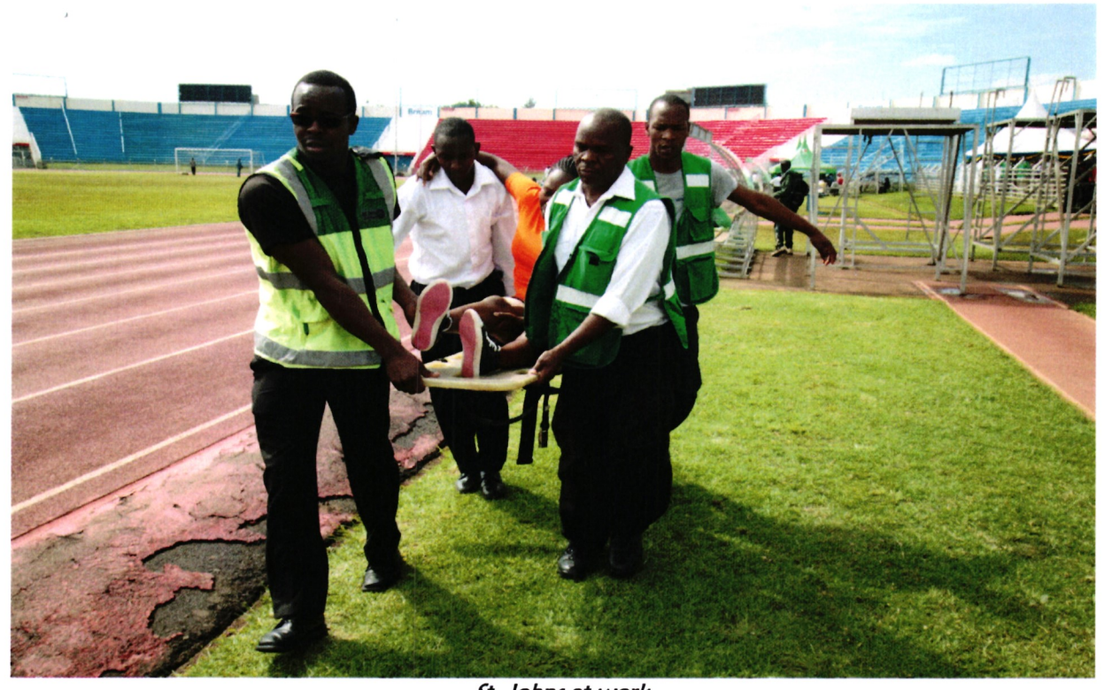
St. Johns at work