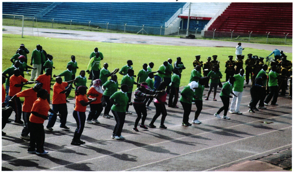
The day begun in style - Aerobics for warmup