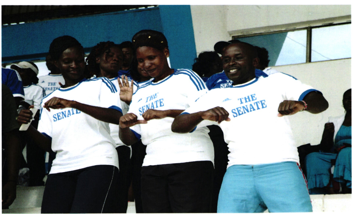
It goes without saying