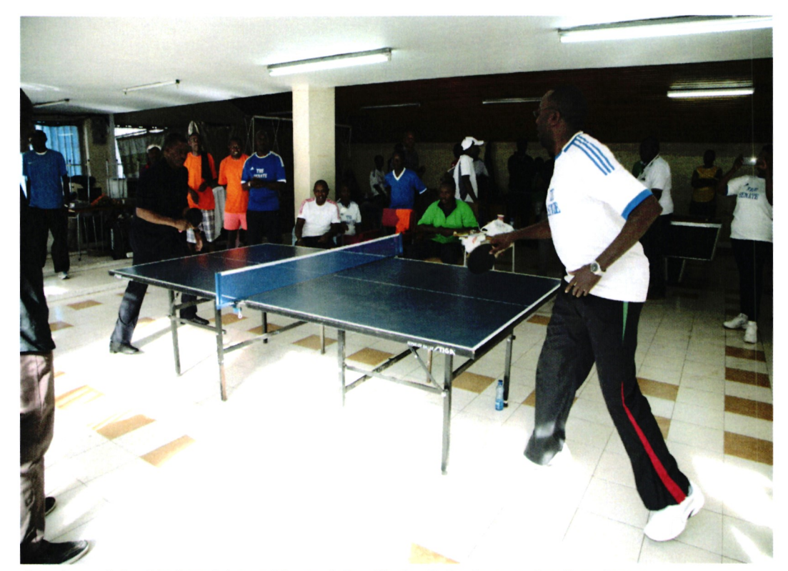
Speaker of the National Assembly and the Clerk of the Senate leading the way