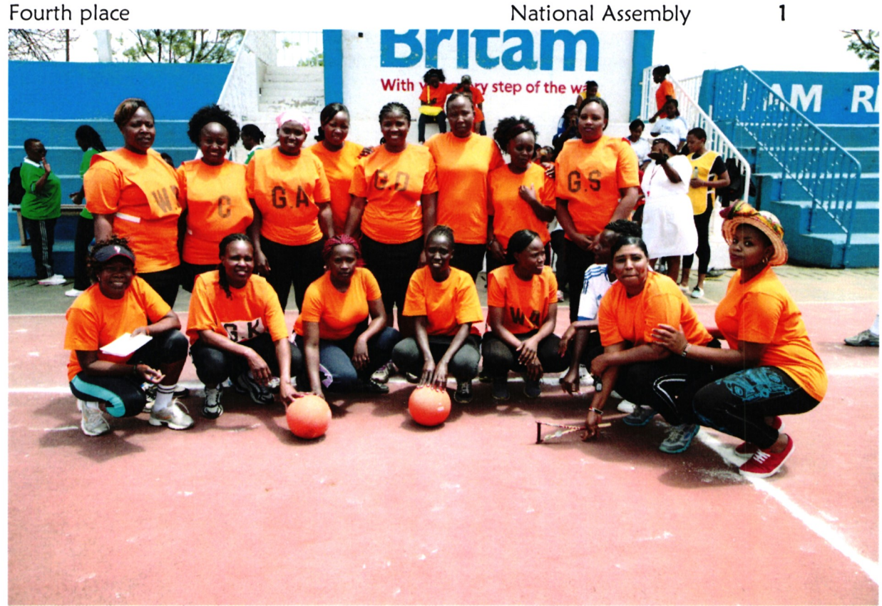
Netball team Joint Services

Winners trophy /Gold medalists Runners up trophy / silver medalists Second runners up trophy /bronze medalists Fourth place Joint Services Senate Parliamentary Police Unit National Assembly