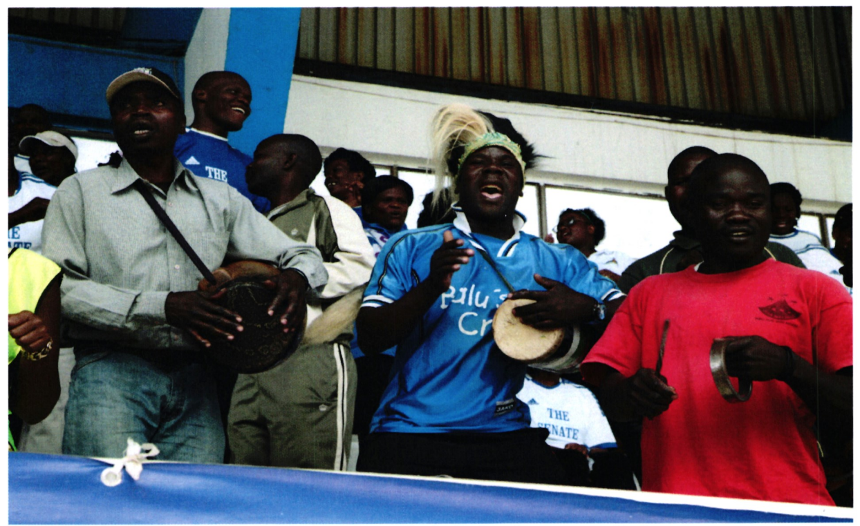
The mood of the day set by isukuti as demonstrated below