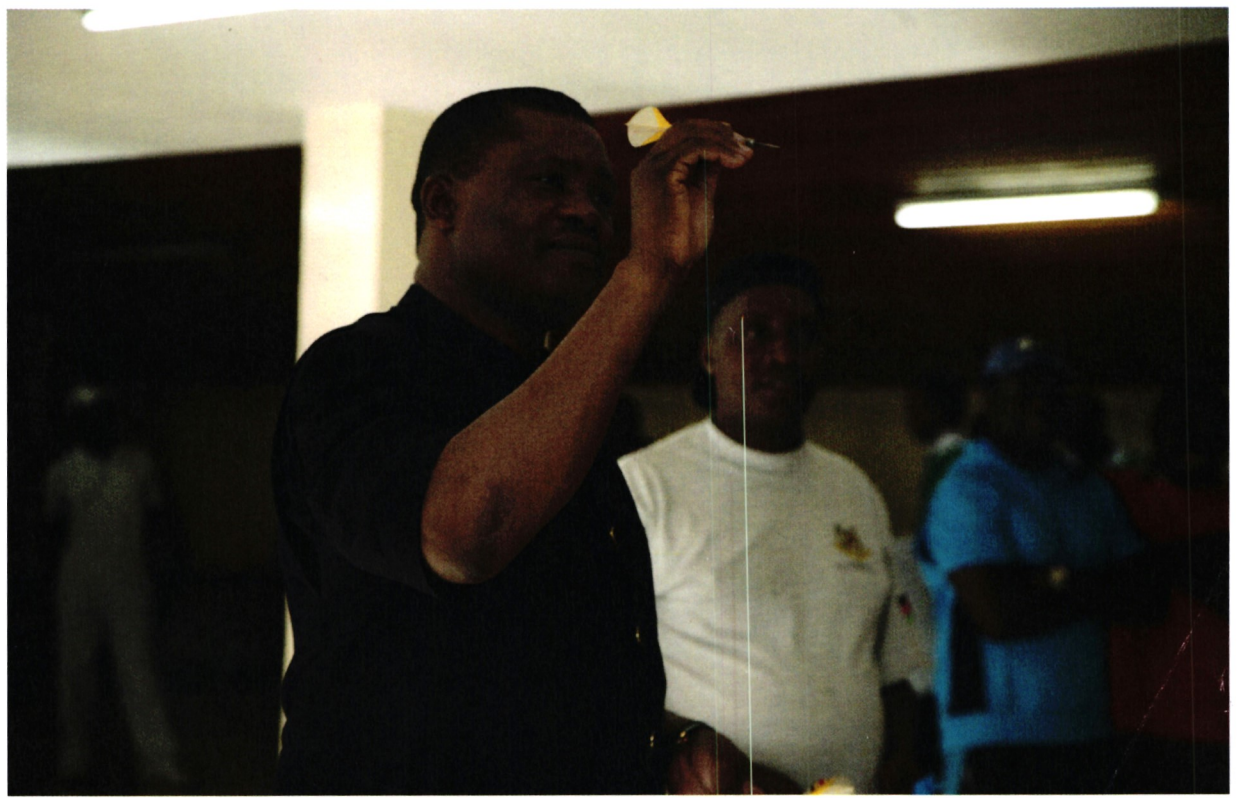
Leading by Example Hon. Speaker of the National Assembly in action