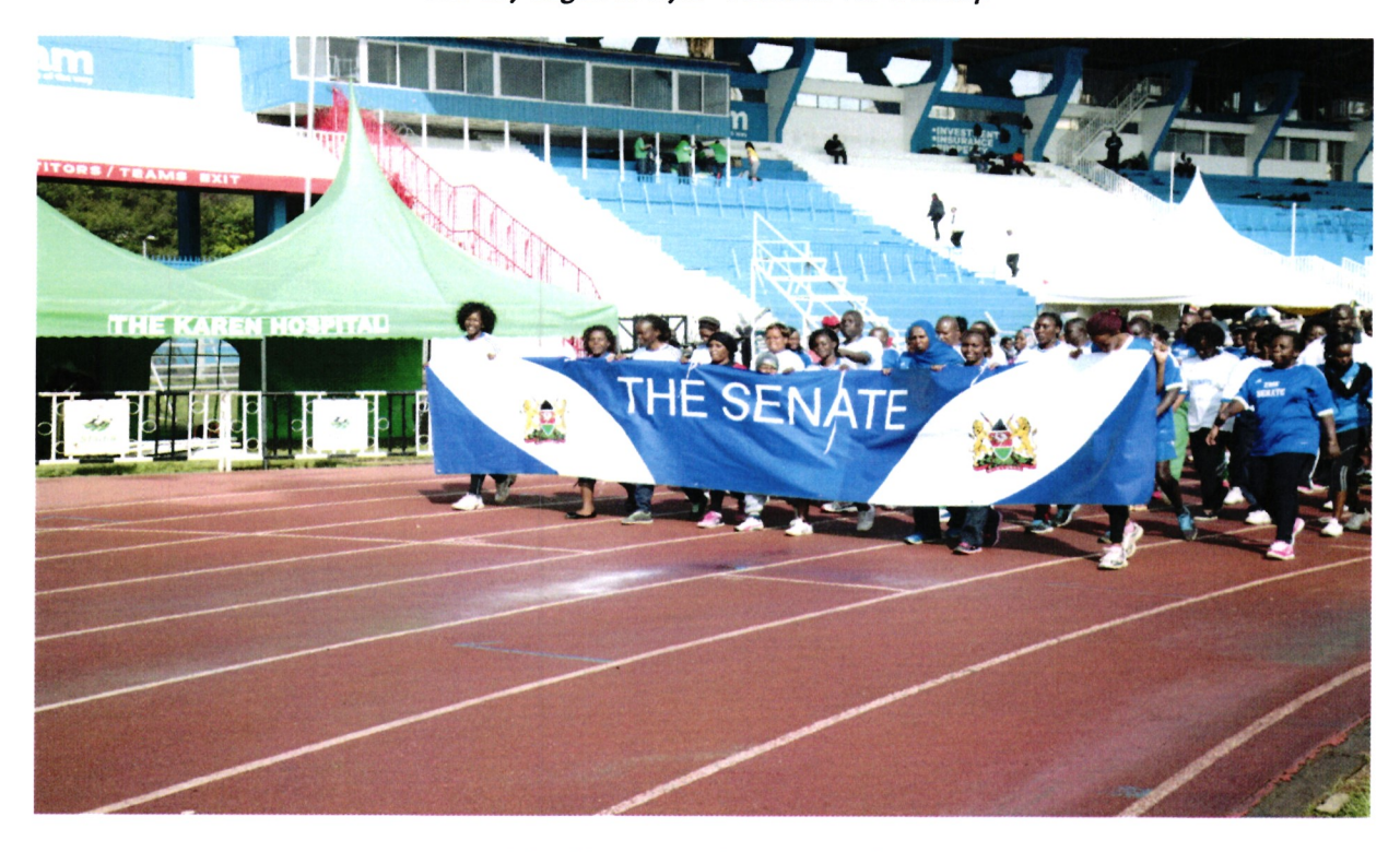
Marching procession per services