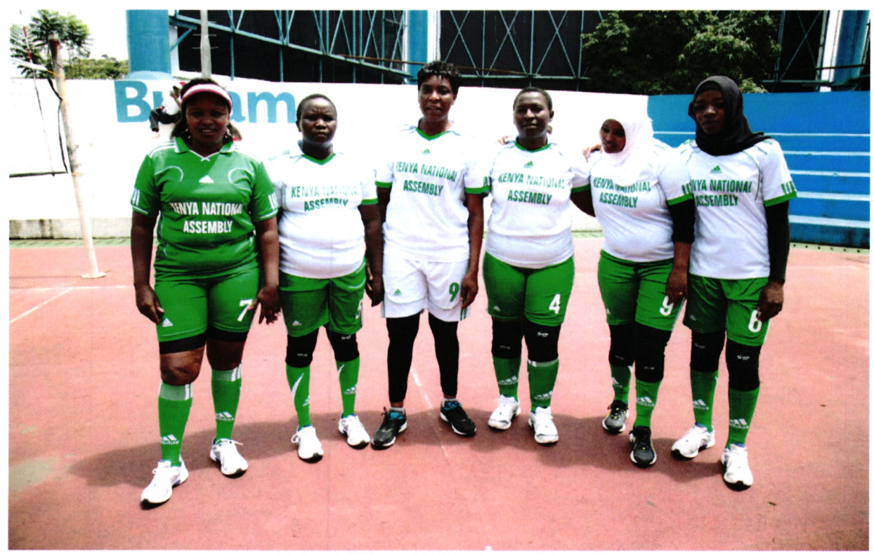
Volleyball Team National Assembly