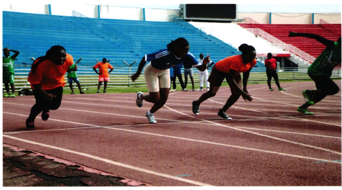
Going for the prize