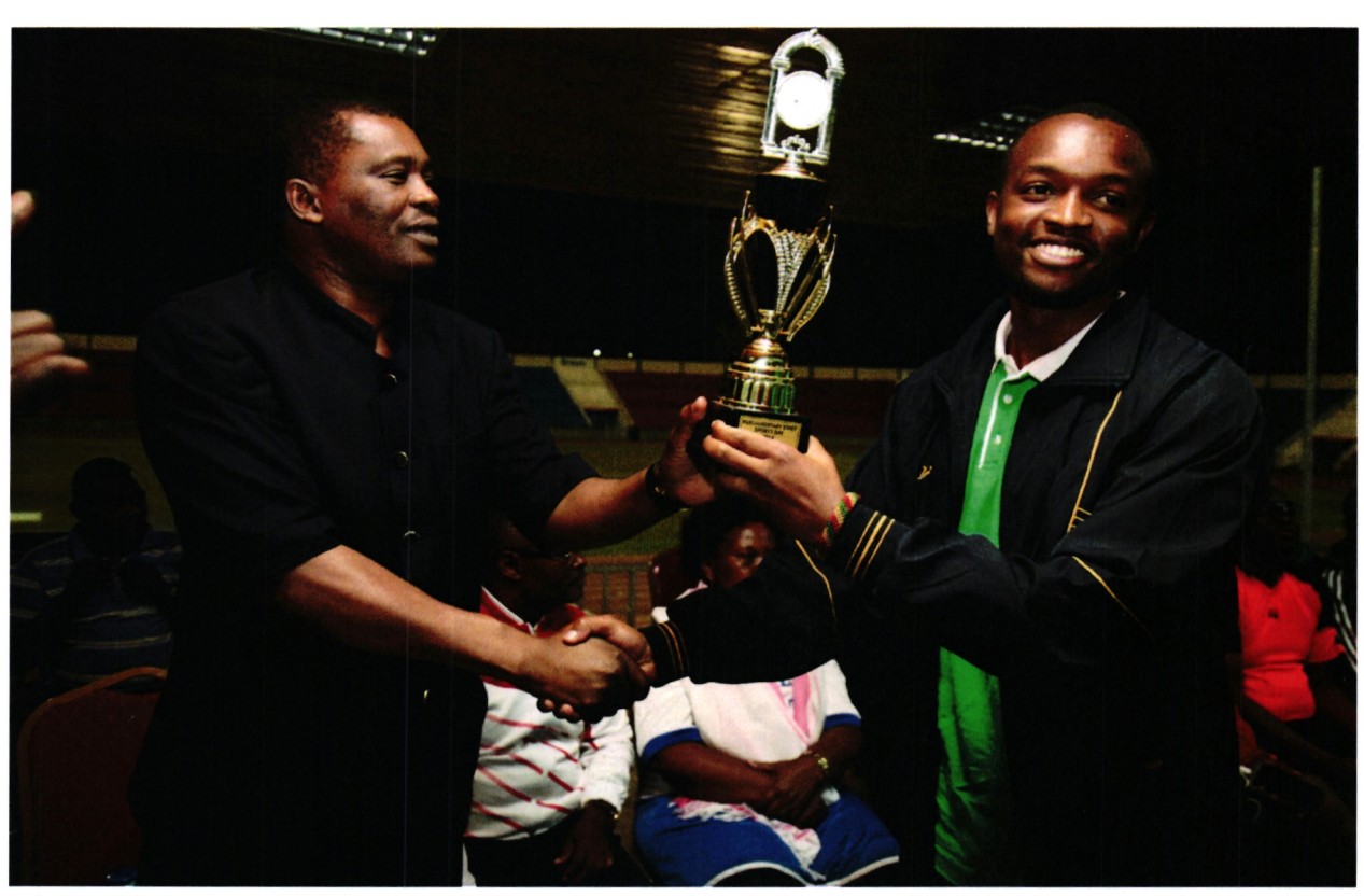
Participant from National Assembly being awarded by the Speaker of the National Assembly