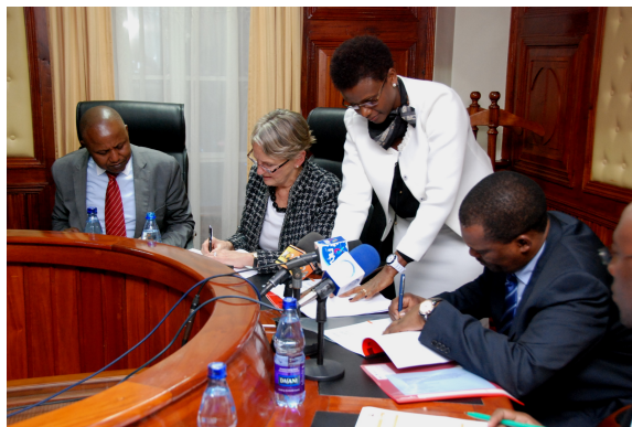
Parliamentary Service Commission Signs an MoU with UNITAR