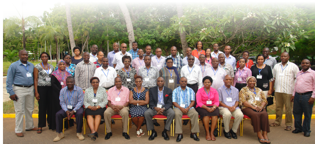
PSC Directors Forum at Sarova Whitesands Beach Resort & Spa Mombasa