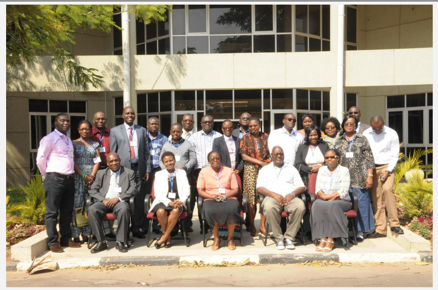
Members of the Senior Management from Zambian Parliamentary service commission pose for a group photo after Strategic Plan Orientation training in Lusaka Zambia