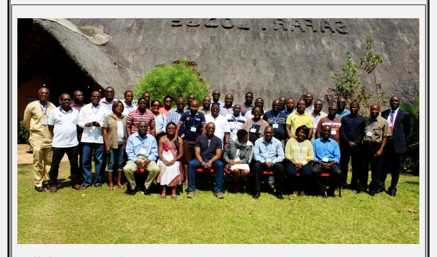
Staff of Zambian National Assembly during a Result Based Management Training in Lusaka Zambia from 28th August -4th September 2015