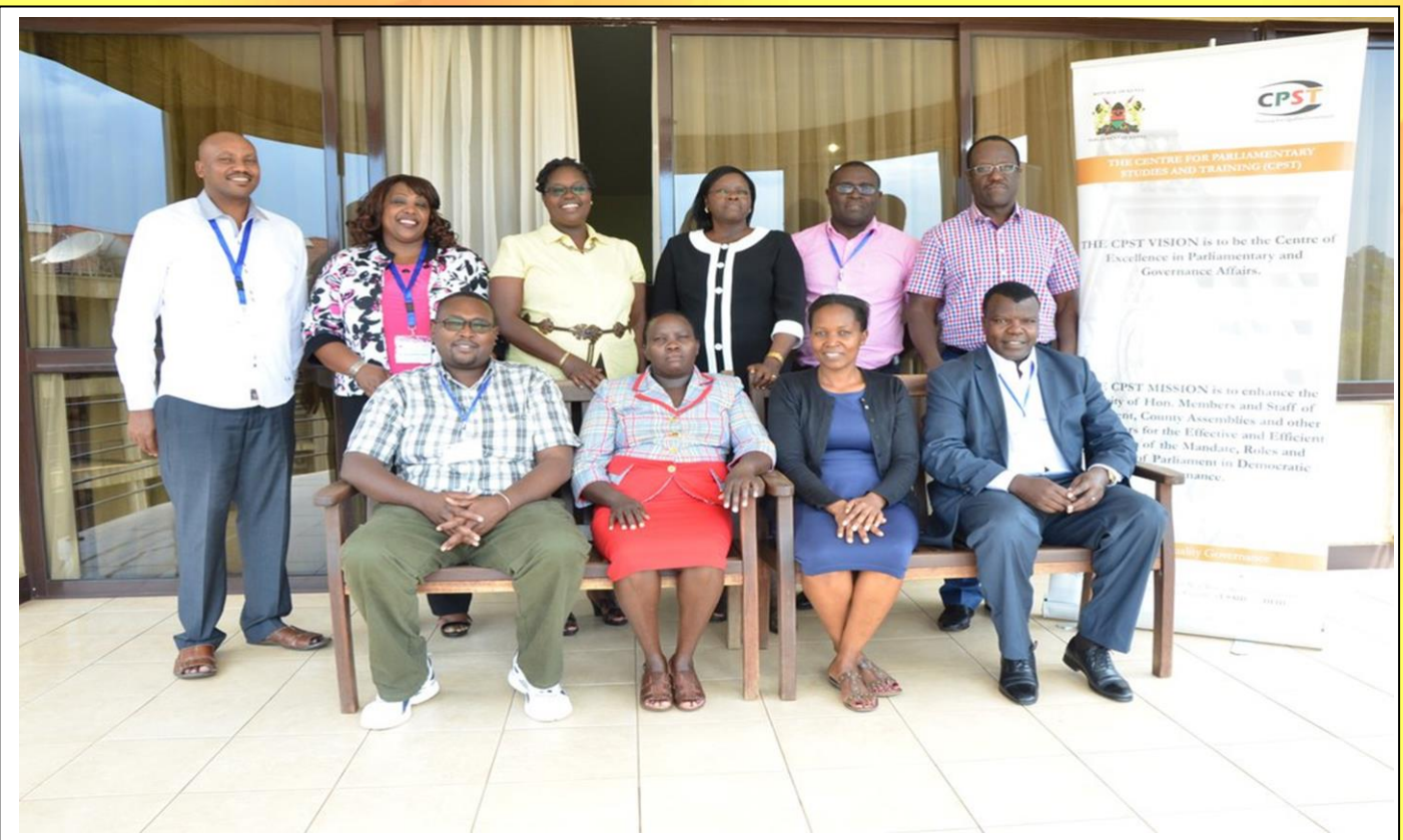
Human Resource Management and Administration in the Legislature (PSC) Staff, during a workshop in Protea Hotel, Kampala Uganda on 11 - 17 October, 2015