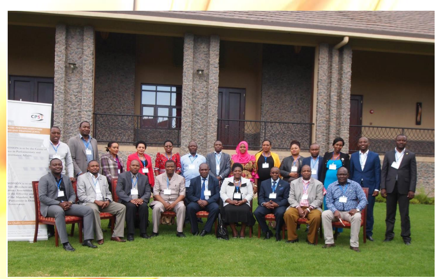
Committee Clerks from the Parliament of Tanzania at Enashipai Resort & Spa in Naivasha during a tailor made workshop that ran from 14th to 18th September 2015.

In order to ease the pressure of training, participants were treated to an excursion with a visit Olkaria I Geothermal Power Station, a facility located in the Hell's Gate National Park along with its sister stations, Olkaria II and Olkaria III.